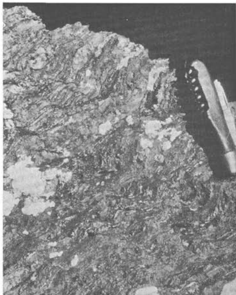
Fig. 1: Different types of rhythmical layered beds of the Bündner Schiefer and Tauern-flysch formation. a, b: Deposits of typical flysch appearance with carbonate-quartz layers and lime-free phyllitic layers; third and fourth member, resp., Schmirn valley. c: Calcphyllite with thin, rhythmically intercalated lime-free blackschieists layers; fifth member, ridge between Schmirn and Naviser valley. For further explanation, see text.

rhythmic layering: very fine layers of lime-free blackschieists (rarely up to a few centimetres thick) are intercalated in the calcschieists at intervals of several centimetres. The quartz content of the rock occasionally increases considerably.