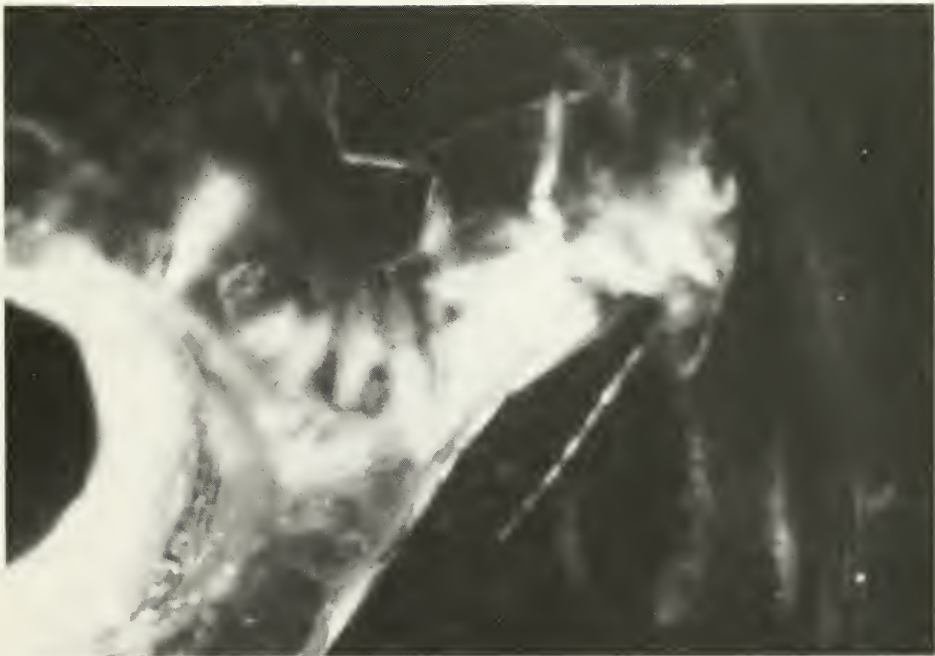
Fig. 3: Berendtimirus progenitor gen. n., sp. n. Holotype, location of the insect in the amber inclusion. White rest.