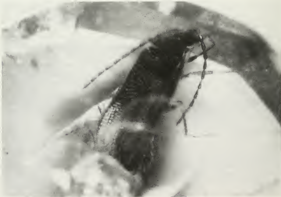
Fig. 1: Berendtimirus progenitor gen. n., sp. n. Holotype, dorsal view. Black rest.