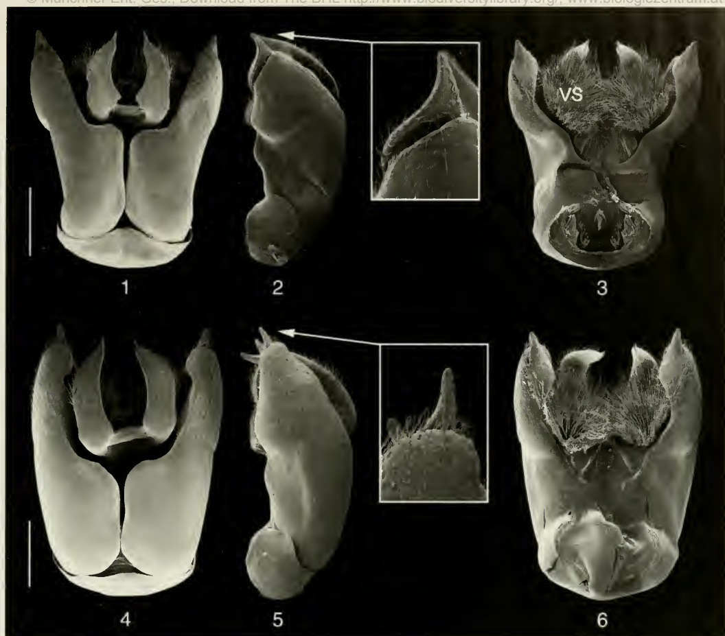
Figs 1-6. Male genitalia; left: dorsal view, middle: lateral view, window: detail of apical region of gonocoxite showing gonostylus, right: ventral view. 1-3, R. nigripes FRIESE; 4-6, R. schoenitzeri sp. n. VS: volsella. Scale bar: 250 \mu m.

developed, Figs 7, 9); dorsal tooth-like projections of BPAS 7 long, Figs 10, 11 (short, Figs 7, 8); APAS 7 basally with long tooth-like projection on ventral side, Fig. 11 (tooth-like projection short, strongly reduced, Fig. 8); gonocoxite long, at least 2.5 times as long as broad in lateral view, Fig. 5 (truncate, only 2 times as long as broad, Fig. 2); apical part of gonocoxite hardly diverging, longer (1.3 times) than broad in lateral view, with dense punctation, Figs 4-6 (considerably diverging, as long as broad, with dispersed punctation, Figs 1-3); GS strongly truncate, only tooth-like apical part protruding gonocoxite in lateral view, Fig. 5 (GS distinctly protruding gonocoxite in lateral view, Fig. 2).