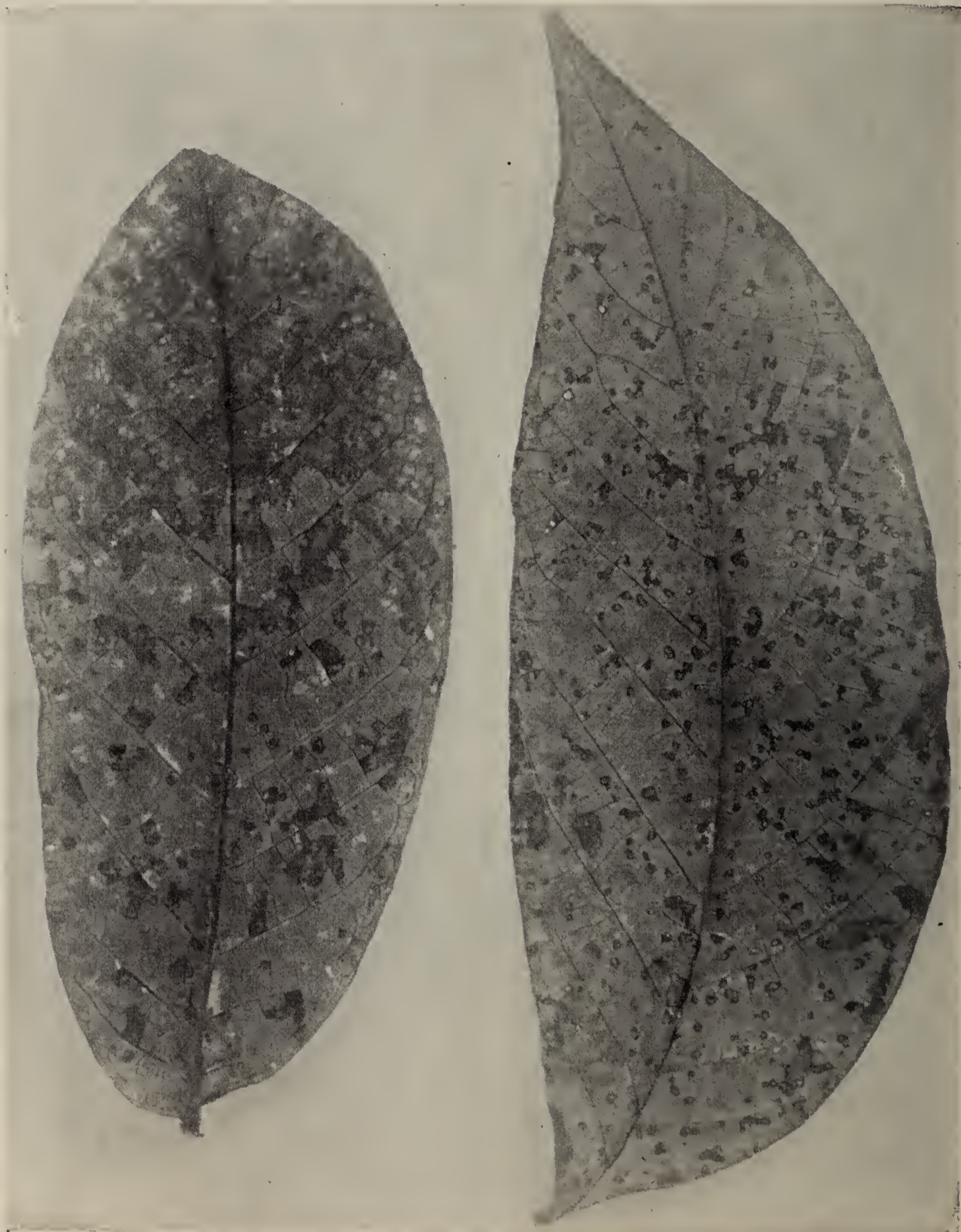
Photograph of English Walnut leaves affected by Cylindrosporium Juglandis .

maturity, liberating the conidia (fig. 2). The conidia are curved, tapering at the upper end and pluriseptate. There are typically no constrictions at the septa although they have been observed to occur. They vary in