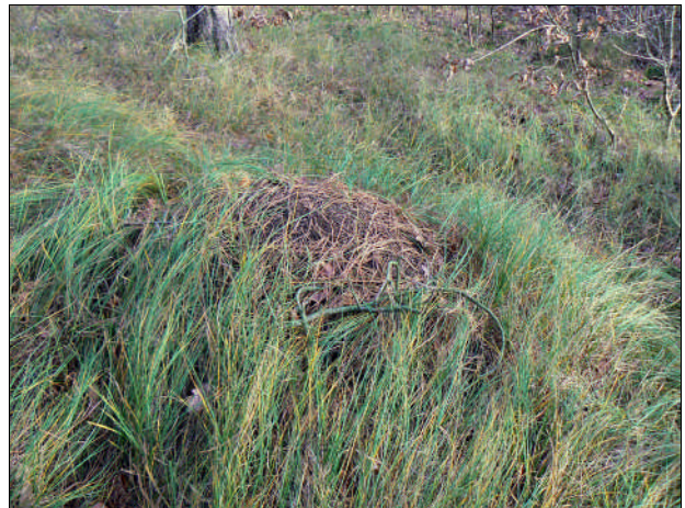
Fig. 2: One of the Formica rufa mounds where dozens of F. rufa workers infected by Pandora myrmecophaga were found. The mound is partly overgrown by Carex arenaria . It is situated in a coniferous wood, bordering a birch-oak wood, in the coastal dunes of Bergen, The Netherlands.

Formica rufa wood ants displaying summit disease were found on 16 (= 22 %) of the 74 investigated wood ant mounds between 4 and 23 October 2007 (including seven mounds without any vegetation within a radius of 1 metre). These wood ants were almost exclusively found on the vegetation on the mounds. This vegetation consisted mainly of Carex arenaria (Fig. 2), sometimes Calama-