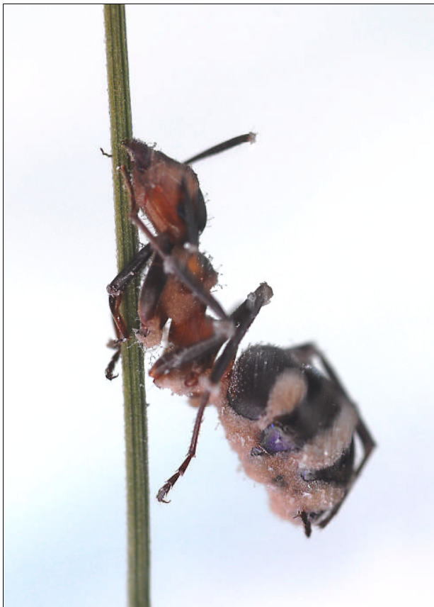
Fig. 1: Pandora myrmecophaga on Formica rufa , from coastal dunes of Bergen, The Netherlands, 4.X.2007.

naria L., to study their behaviour. About 45 dead infected ants attached to leaves were collected, to study the nature of the attachment.