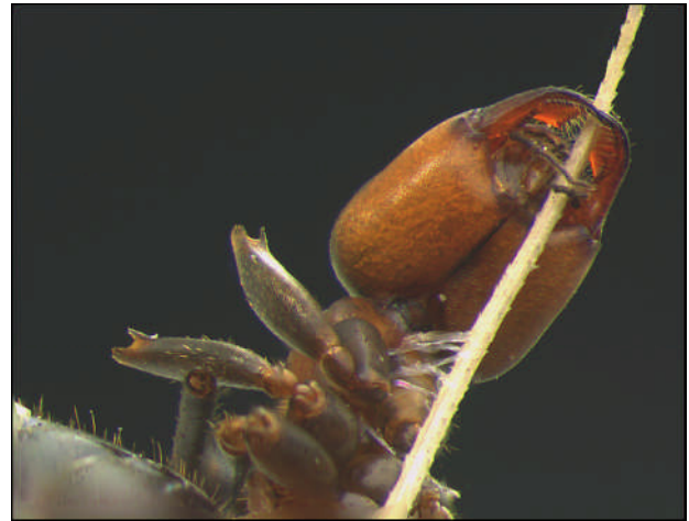
Fig. 4: Pandora myrmecophaga rhizoids growing out of the intersegmental parts of the basisternum and laterocervical plates of a Formica rufa worker that had died of the infection. Magnification 50×.

My behavioural observations largely agree with those of MARIKOWSKY (1962) and LOOS-FRANK & ZIMMERMANN (1976). An important difference between my observations and those of LOOS-FRANK & ZIMMERMANN (1976) is that they generally observed that first Pandora attaches to and twists around the leaf, the ant still being alive, and only then does the wood ant start holding onto the leaf with her mandibles. I did not observe fungal rhizoids on collected wood ants in phases 1 through 4, and neither did MARIKOWSKY (1962). ROY & al. (2006) consider the active attachment to the substrate by the insect host through use of mandibles to be limited to Coleoptera (Cantharidae) in-