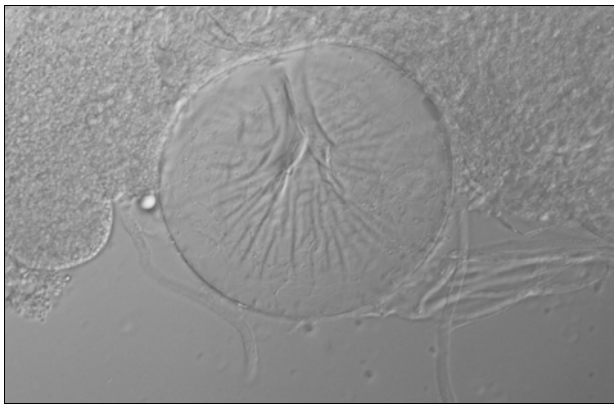
Fig. 3: Spermatheca of an inseminated intermorph of the ant Technomyrmex vitiensis . Only few spermatozoa were present (see text). Picture taken at 100× with a ZEISS Axiophot microscope.

esting case with a predicted high degree of cooperation among sexually active individuals as a result of secondary polygyny (YAMAUCHI & al. 1991).