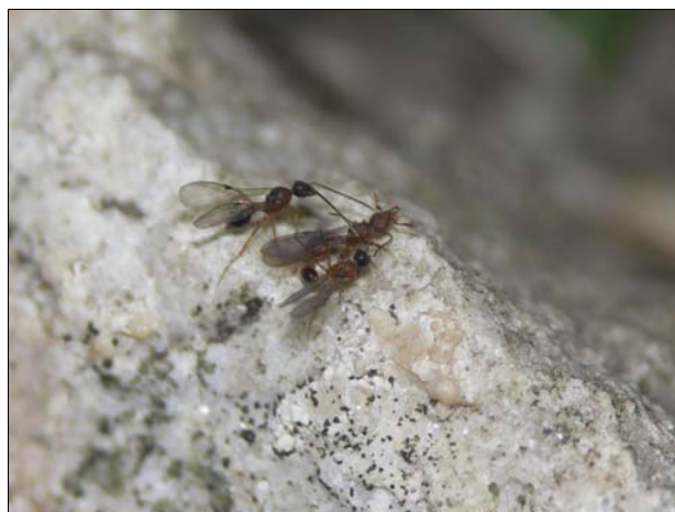
Fig. 1: Two males of Pyramica argiola , courting a gyne. Mating only happens on the ground near the area of the courtship display.

The distribution area of P. argiola is centred around the Mediterranean basin (BERNARD 1968), which implies that