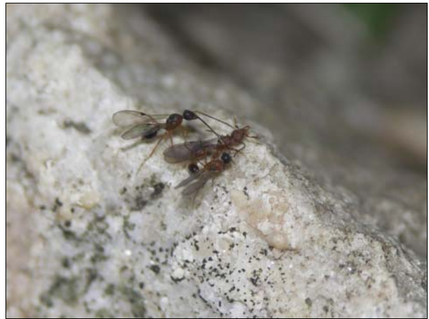
Fig. 1: Two males of Pyramica argiola , courting a gyne. Mating only happens on the ground near the area of the courtship display.

The distribution area of P. argiola is centred around the Mediterranean basin (BERNARD 1968), which implies that