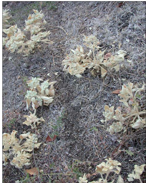
Fig. 1: Trunk trail (runs vertically through photograph) cleared by a Nearctic Messor , M. andrei , California, USA.

Group recruitment is when a leader ant uses motor displays to induce 5 - 30 workers to follow a short-lived odor trail, such as occurs in several Camponotus species (HÖLLDOBLER 1971a), Aphaenogaster cockerelli , A. albisetosus (HÖLLDOBLER & al. 1978), A. senilis (CERDÁ & al. 2009),