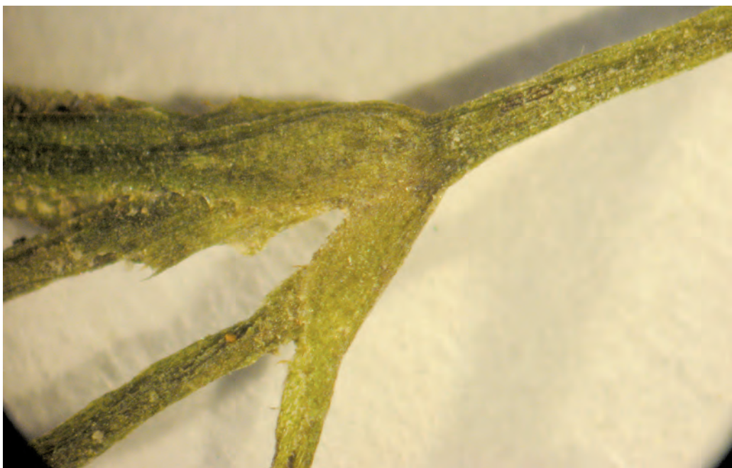
Fig. 3: Najas flexilis from Lake Millstätter See, leaf sheath (Herbarium Systema Company). — Abb. 3: Najas flexilis aus dem Millstätter See, Blattscheide (Herbar Fa. Systema).