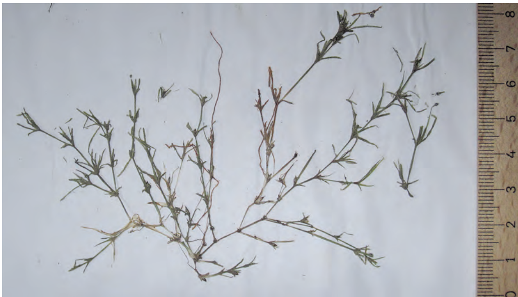
Fig. 2: Najas flexilis from Lake Millstätter See (Herbarium Systema Company). — Abb. 2: Najas flexilis aus dem Millstätter See. (Herbar der Fa. Systema GmbH).