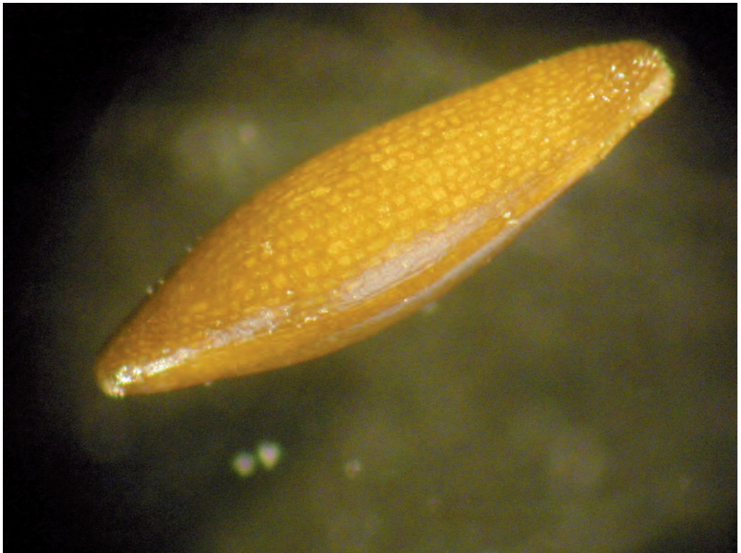
Fig. 4: Najas flexilis from Lake Millstätter See, seed (Herbarium Systema Company). — Abb. 4: Najas flexilis aus dem Millstätter See, Same (Herbar Fa. Systema).

The plants in Lake Millstätter See grew in a loosely outspread way, were almost completely buried in the soft and sandy mud, so that only their shoot tips could be seen. This corresponds to the general habit of the species (CASPER & KRAUSCH 1980). According to ELLENBERG (1996), Najas flexilis appears mostly in groups and can, fol-