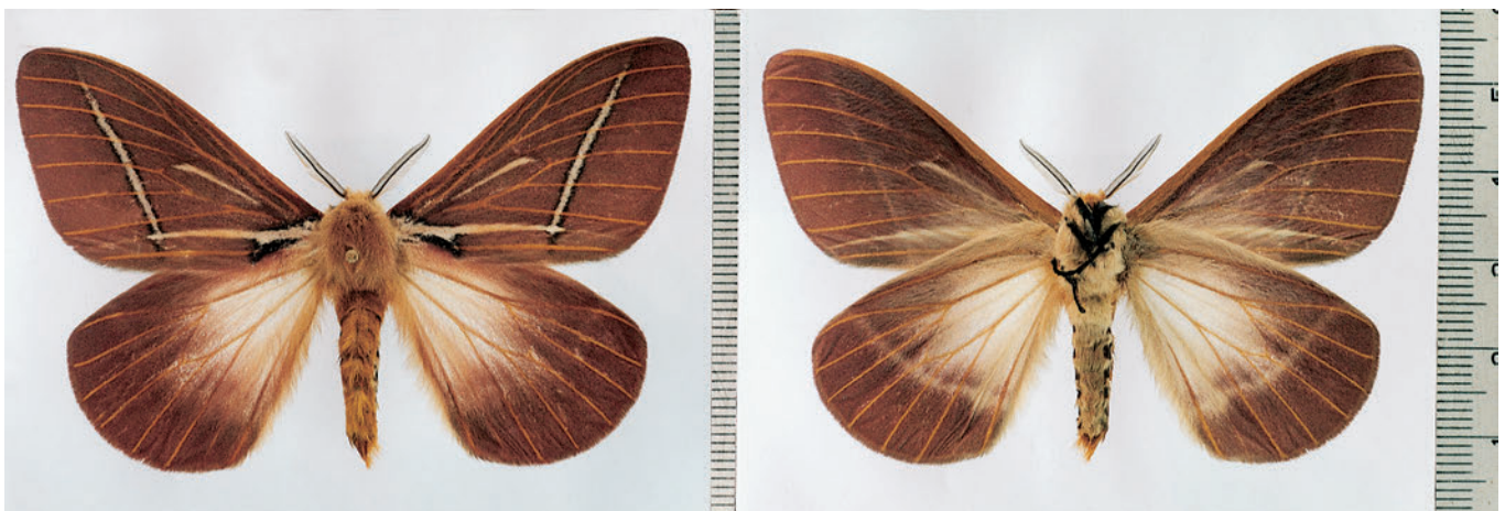
Fig. 1: Kentroleuca novaholandensis n. sp.: holotype ♂ (wingspan 72 mm); left upperside, right underside.

Kentroleuca are medium-sized moths with the following main distinctive traits: antennae black, those of ♂♂ bipectinate with apical bristles longer than setae, of ♀♀ simple or shortly bidentate, labial palpi three-segmented, foretibia with at least one apical spine, tibial spurs number 0-2-3 or 0-2-4, arolium and pulvilli present. The habitus is primarily characterized by the absence of colored rings on the upper surface of the abdomen and the presence on the forewing (except in Kentroleuca dukinfieldi ) of one long white stria each on the discal cell