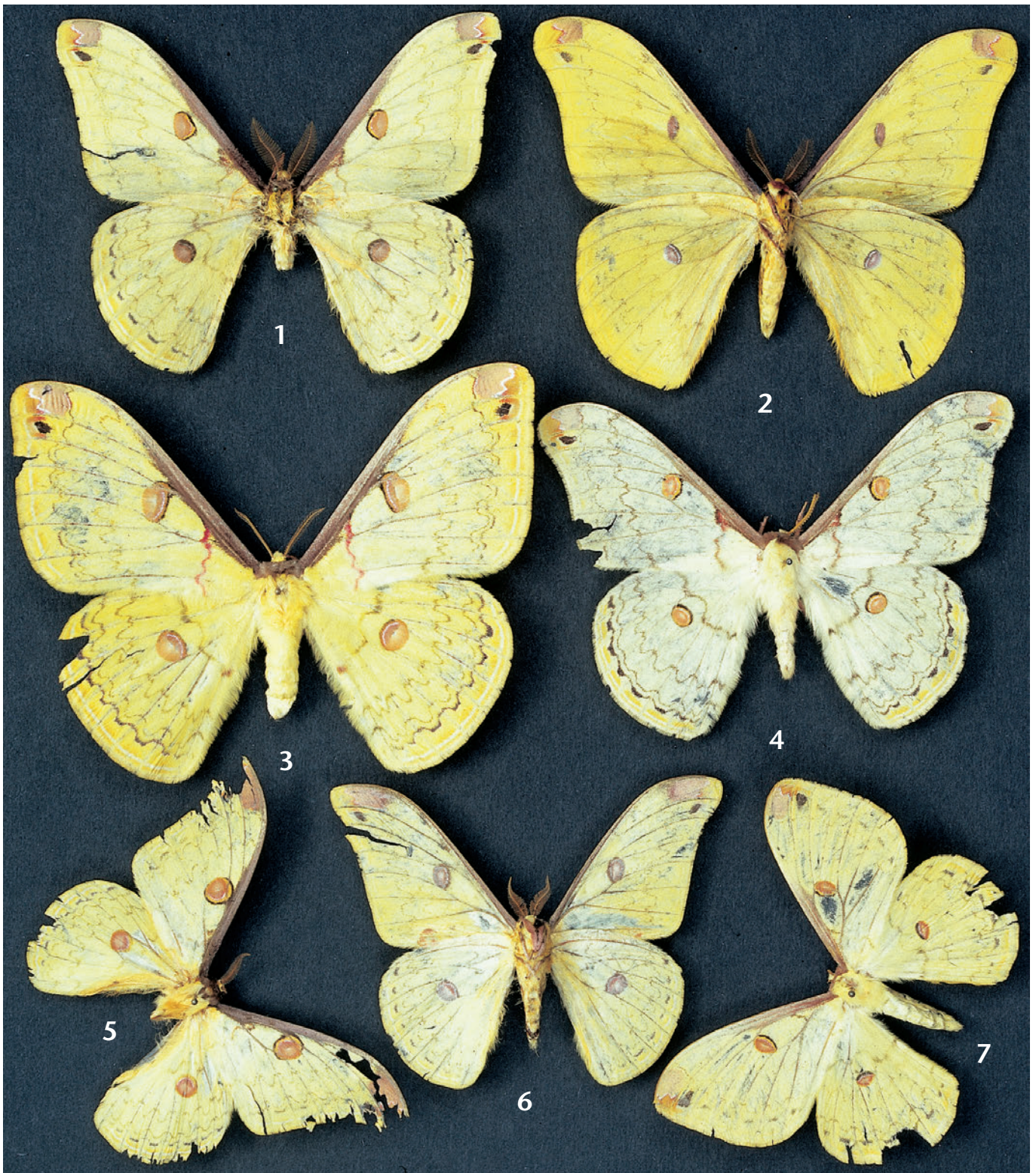
Colour plate. Specimens of Loepa of the miranda -group from China. Fig. 1: Loepa tibeta , ♂ holotype, dorsal view. Fig. 2: L. tibeta , ♂ paratype, ventral view. Fig. 3: L. miranda , ♀, dorsal view, from the type locality of L. tibeta . Fig. 4: L. yunnana , ♂ lectotype, dorsal view. Fig. 5: L. meyi , ♂ holotype, dorsal view. Fig. 6: L. meyi , ♂ paratype, ventral view. Fig. 7: L. meyi , ♀ allotype, dorsal view. — All specimens to the same scale.

of similar colour, antemedian band grey, postmedian and double submarginal band similar to forewing, but outer portion of the submarginal band with dark bluish scales. Hindwing ocellus without or less developed outer black portion, 4–5 mm in maximum diameter. From ventral side in absolute similar ground colour and with similar pattern, but antemedian band of the forewing missing and ocelli of both fore- and hindwings lighter, suffused with white scales in the inner part.