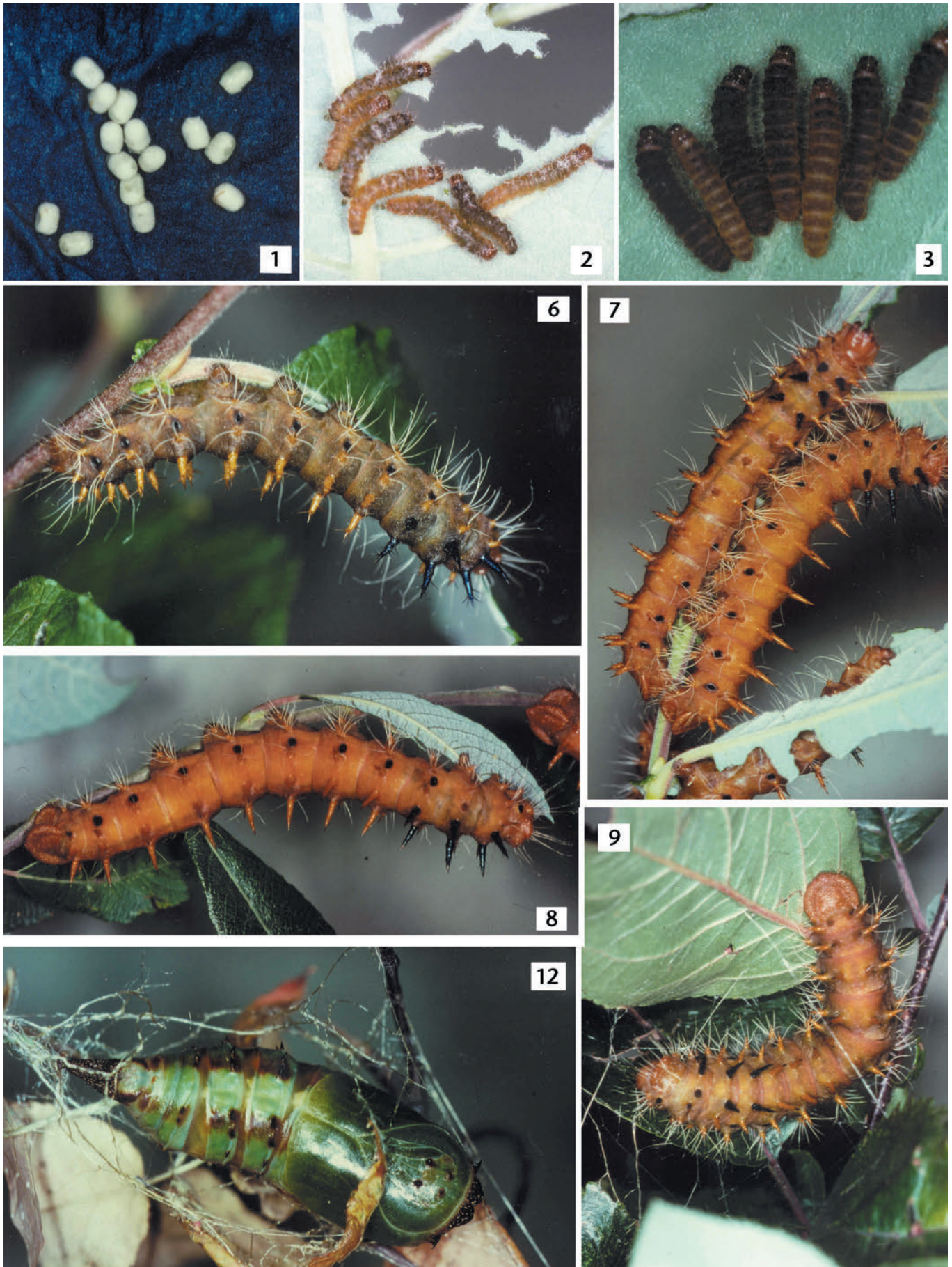
Colour Plates 1 & 2: Pseudantheraea discrepans . Cameroon. Fig. 1: ova. Fig. 1: L 1 . Fig. 3: L 2 . Fig. 4: L 3 . Fig. 5: L 4 . Fig. 6: L 5 . Fig. 7: L 6 . Fig. 8: L 7 . Figs. 9, 10: Praepupa spinning flimsy cocoon and shortly before pupation moult in cocoon. Fig. 11: Fresh pupa with larval skin. Fig. 12: Pupa in very flimsy cocoon. Caused by wind and movements of the food plant, the pupa may easily fall out of these few silken strands and then will hang freely in the plant, head down, held by the cremaster hooks in a silk bolster. Fig. 13: Pupa out of cocoon; see silk in cremastral hooks. Figs. 14, 15: Imagines, Fig. 14 ♂, Fig. 15 ♀.