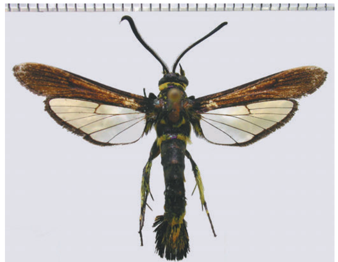
Fig. 1: P. dominiki sp. n., holotype, ♂; scale in mm.