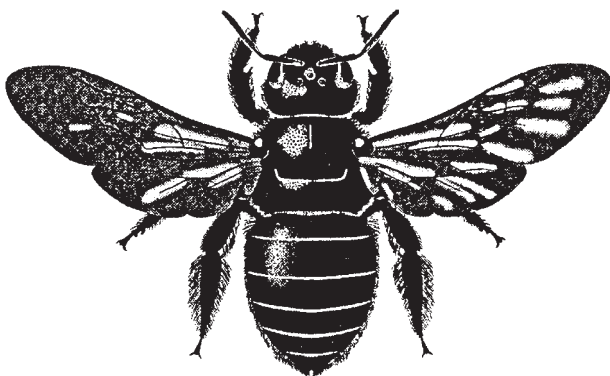
Xylocopa violacea (LINNAEUS, 1758) (Skizze).

Die Blauschwarze Holzbiene ist vom zeitigen Frühjahr bis in den warmen Herbst hinein zu beobachten. Sie ist etwas größer als eine Hummelkönigin, aber nicht farbig wie diese, sondern völlig blauviolett-schwarz glänzend mit dunklen Flügeln und geringer Behaarung, und wirkt weniger rund als eine Hummel, sondern