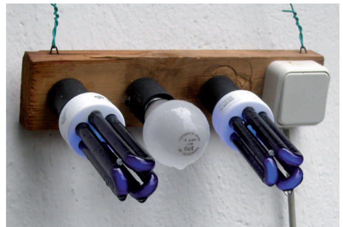
Abb. 1: Einfache, transportable Anlage zum Lichtfang, bestehend aus zwei 25-W-UV-Energiesparlampen und einer 100-W-Normalglühlampe.

Zufälligerweise stieß ich beim Besuch eines Elektronikdiscountmarktes auf eine „UV-Energiesparlampe E27“. Diese Lampen finden sich allerdings nicht in der üblichen Leuchtmittelabtei-