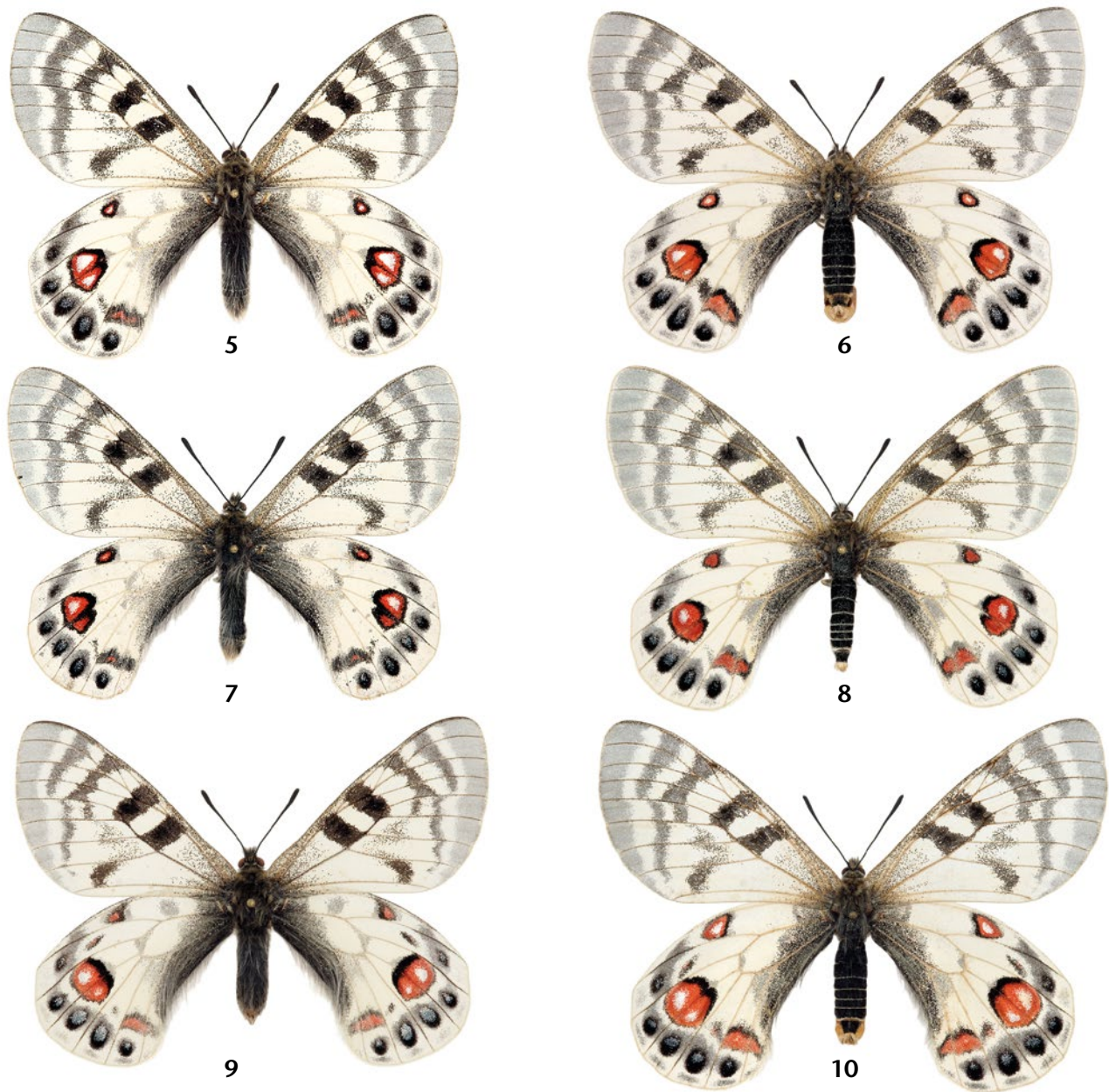
Plate 2: Parnassius (Kailasius) charltonius . — Figs. 5–6: P. (K.) ch. platon , W. Tajikistan, Ghissar Range, Iskanderdariya R., Narvad vill. vicin., 2200 m, 10.–11. vii. 2011, SOCHIVKO A. leg. Fig. 5: ♂. Fig. 6: ♀. — Figs. 7–8: P. (K.) ch. platon , NW Tajikistan, Istaravshan Distr., Turkestan Range, Argly R. bass., Ovchi vill. vicin., 2200 m, 24.–26. vii. 2010, SOCHIVKO A. leg. Fig. 7: ♂ (variation). Fig. 8: ♀ (variation). — Figs. 9–10: P. (K.) ch. sochivkoi . Fig. 9: ♂, SW Kyrgyzstan, Khaidarken Town vicin., Alai Mts., Allauidin R., 2850–3000 m, 1.–12. vii. 2007, SOCHIVKO A. leg. Fig. 10: ♀, SW Kyrgyzstan, Alai Mts., Kadamzhai distr., Eki-Daban R. (Aksu R. trib.), 3000 m, 26. vii. 2009, SOCHIVKO A. leg. — Specimens approx. natural size.

SAKAI 2002, TSHIKOLOVETS 1997, WEISS 1991). Reliable data which, however, require revision were published by A. V.-A. KREUZBERG only (KREUZBERG 1984, 1985, 1987a, b, 1989, KREUZBERG & PLJUSHCH 1989, KREUZBERG & DJAKONOV 1993). The bringing together of botanical and entomological data resulted in the discovery of new populations of papilionids, Parnassius (Kailasius) charltonius GRAY, 1853 among them. After the finding of the local and dense population of this species in Turkestan Range, on Sarkat River (SOCHIVKO & KAABAK 2011), the field work was continued in West Tajikistan and the neighboring territories of SE Uzbekistan (see Map, Fig. 1).