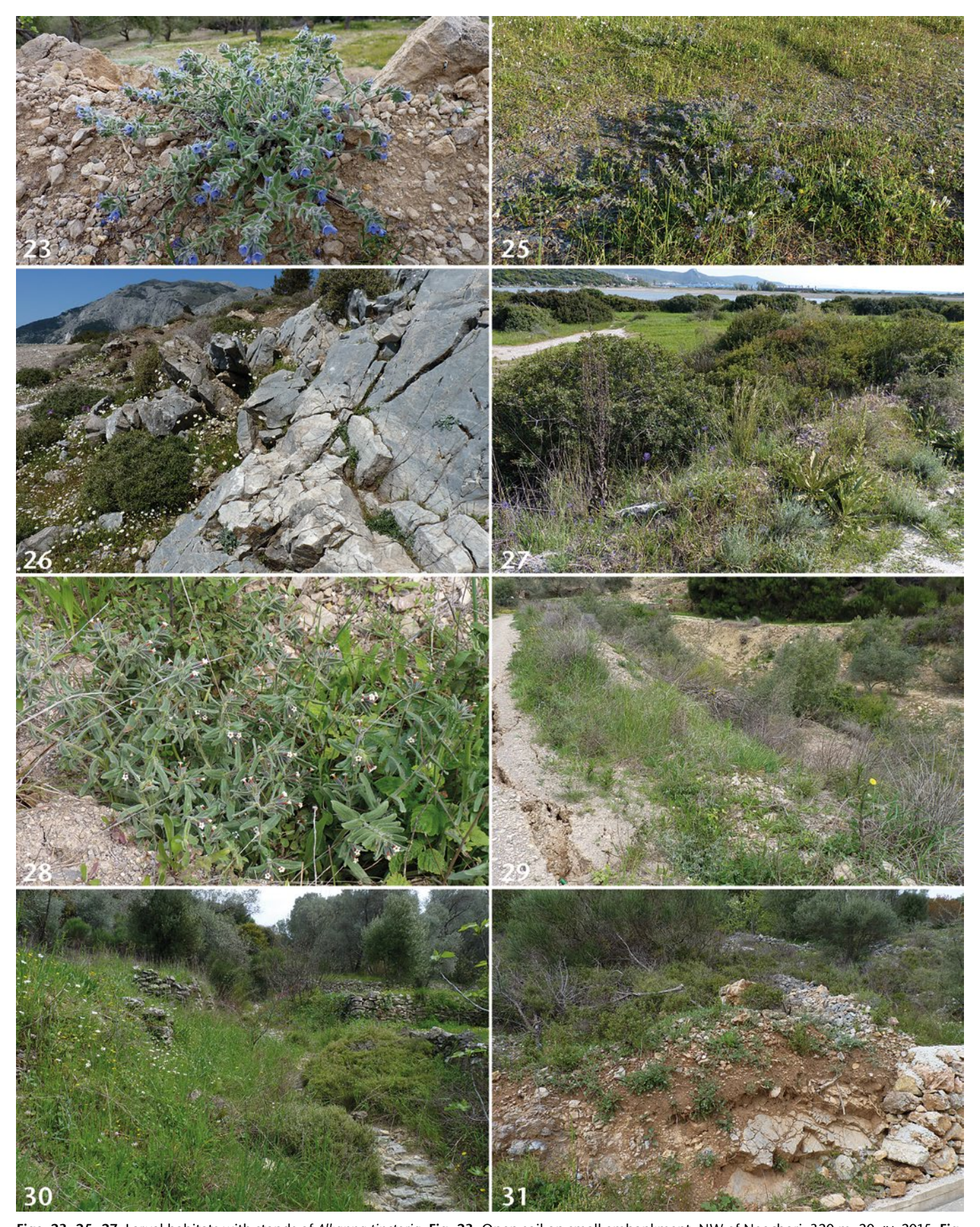
Figs. 23, 25–27: Larval habitats with stands of Alkanna tinctoria . Fig. 23: Open soil on small embankment, NW of Neochori, 320 m, 20. IV. 2015. Fig. 25: S of Moni Megalis Panagias, 380 m, 21. IV. 2015. Fig. 26: On rocky slope, NW of Marathokambos, 700 m, 22. IV. 2015. Fig. 27: Near the coast on small embankment in foreground; Psili Ammos, 5 m, 20. IV. 2015. — Figs. 28–31: Habitats with Alkanna tubulosa . Fig. 28: Near Pyrgos, 20. IV. 2015. Fig. 29: Roadside embankment, Pyrgos, 20. IV. 2015. Fig. 30: In an old olive grove, Pyrgos, 20. IV. 2015. This habitat is one of the most densely vegetated examples. Most habitats show more open soil or rocks. Fig. 31: Typical larval habitat on rocky roadside embankment, Pyrgos, 20. IV. 2015. Material from Samos, all photos except pupa and imago (rearing photos) taken in the field.