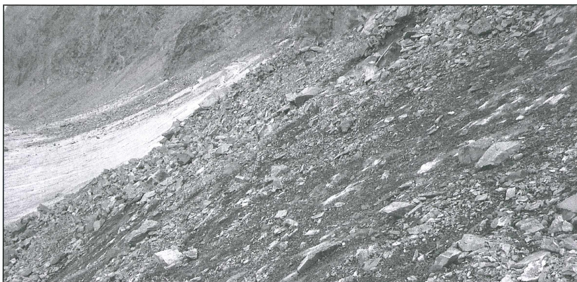
Figure 1: Due to debris-fall and glacier retreat a steep debris-covered ice slope has developed at the margin of a glacier. To reach the summit of Lisener Ferner Kogel mountaineers have to cross this dangerous terrain. Lisener Ferner, Stubaier Alpen (Photo: F. Braun)

The Alpine trail network is the infrastructural basis for summer mountain tourism (hiking, mountaineering) in a mountainous country such as Austria. Landscape modifications resulting from climate change (e.g. glacier retreat, permafrost degradation) affect the accessibility and usability of the trails and of the terrain in high mountain areas, often causing considerable risk for mountaineers (Fig. 1 and 2; see also BEHM et al. 2006; SCHWÖRER 2002). The quality of the trail network is a decisive factor for the safety and appeal of summer mountain tourism. Alpine associations work hard to tackle problems once they become acute. Preventive activities on a large scale are not possible since the Alpine associations do not have enough funds and voluntary workers available. The future situation of problematic areas cannot be modelled precisely. Nevertheless general strategic considerations are crucial to facilitate future planning and development of the high Alpine trail network.