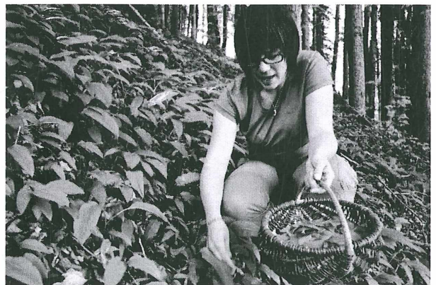
Figure 3: Woman collecting „Bärlauch“ ( Allium ursinum )