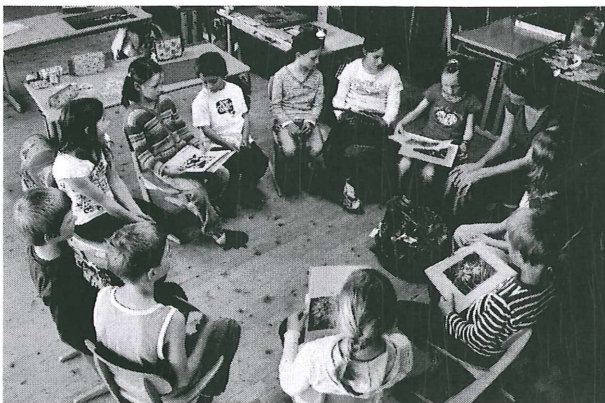
Figure 2: Discussing plant species by means of puzzle-pictures, dried and fresh gathered plant species and several products made from wild gathered plant species with children in the primary school Blons, Großes Walsertal

Involving schools in data collection raised the consciousness of many local people in the Biosphere Reserve Großes Walsertal concerning the issue of plant gathering and use. When children and grandchildren asked older people about plant gathering, the adults became aware that their knowledge is not "just common and nothing special", as they often mentioned, but absolutely worth to be transmitted. The children themselves got curious about plant gathering and started to perceive their surrounding nature with more open eyes. The results were disseminated to and through the children in schools and in the local newsletter from the Biosphere Reserve to carry on the discussion. The school project initiated a process of exchange and transmission of knowledge which is now continuing "by itself". Children are tomorrow's generation!