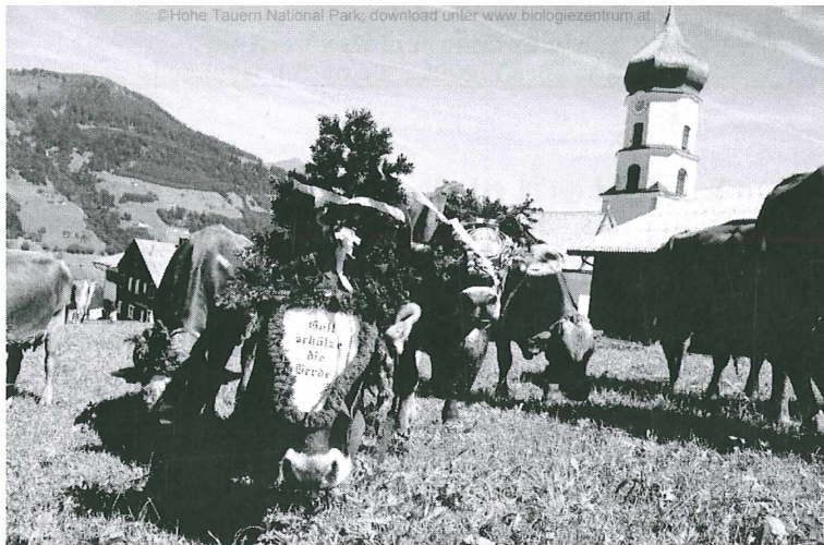
Figure 4: „Alpabtrieb“– going down with livestock from Alpe Laguz to Raggal