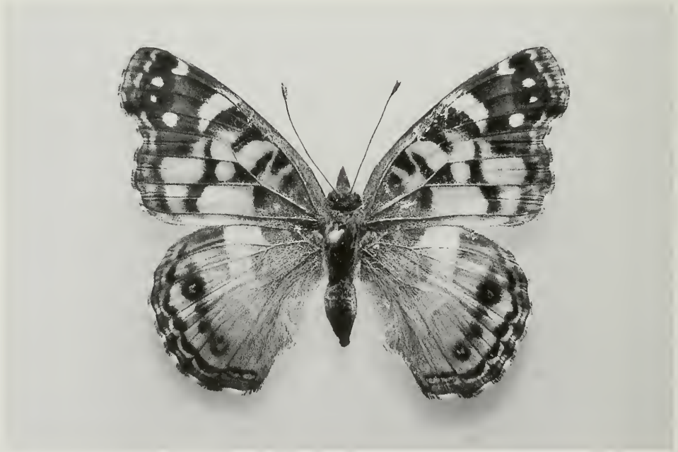
Fig. 2: Vanessa virginiensis . Dorsal aspect of a female from Tenerife for comparison.