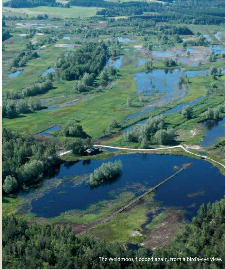
The Weidmoos, flooded again, from a bird's-eye view.

Through these measures, the Weidmoos has been secured as an important retreat for rare bird species.