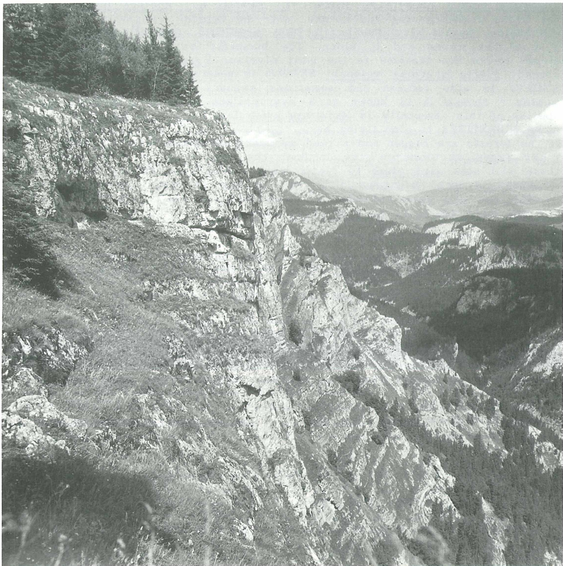
Habitat of P. dorylas magna ssp. nov. in the Eastern Carpathians - Area of Cheile Bicazului, Suhardul Mic about 1100 m (Judetul Harghita, Rumania)