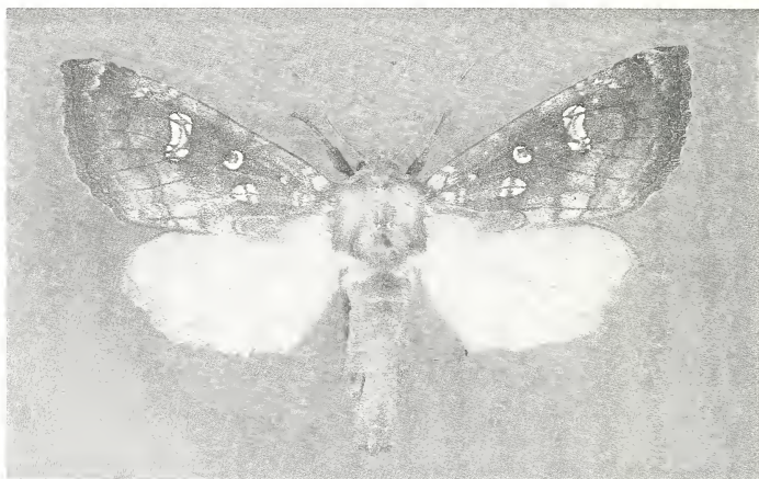
Fig. 2. Gortyna borelii lunata FRR. ♀, Hungary, Hortobágy Nat. Park, Újszentmargita.

G. borelii lunata has therefore only two foodplants for certain in the region of the Carpathian Basin : Peucedanum longifolium (Mt. Domogled, S. Carpathians) and P. officinale (populations of the Carpathian Basin).