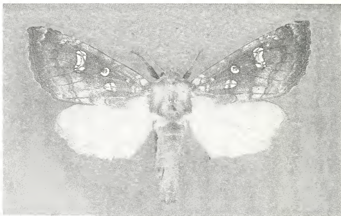
Fig. 2. Gortyna borelii lunata FRR. ♀, Hungary, Hortobágy Nat. Park, Újszentmargita.

G. borelii lunata has therefore only two foodplants for certain in the region of the Carpathian Basin : Peucedanum longifolium (Mt. Domogled, S. Carpathians) and P. officinale (populations of the Carpathian Basin).