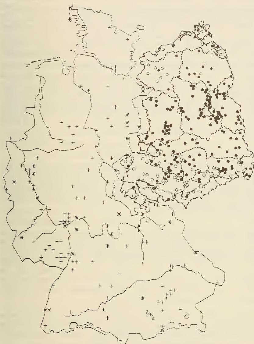
Figure 2. Distribution of Pontia (daplidice) edusa FABRICIUS in Germany. BRD : + = before 1960, * = after 1960 (SCHREIBER, 1976). DDR : circles = before 1950, spots after 1950 (REINHARDT & KAMES, 1982).