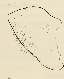
Figure 3. Pontia (daplidice) edusa FABRICIUS : Left valve of the male in Linnean Collection. Dissected by P. R. ACKERY, sketch by Mrs. R. ARORA.

No reliable type-material is known for the nominal species-group taxa edusa FABRICIUS, 1777, raphani ESPER, 1783, edusa FABRICIUS, 1787 (nec 1777), bellidice OCHSENHEIMER, 1808, belemida GEYER, 1832, and persica BIENERT, 1869.