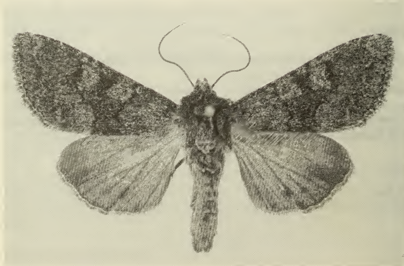
Fig. 1. Mamestra tayulingensis sp. n., ♀, paratype.

HOLOTYPE : ♂, Taiwan, Hualien Hsien, Tayuling (2600 m), 28-31. iii. 1981 (H. YOSHIMOTO leg.), preserved in the National Science Museum (Nat. Hist.), Tokyo.