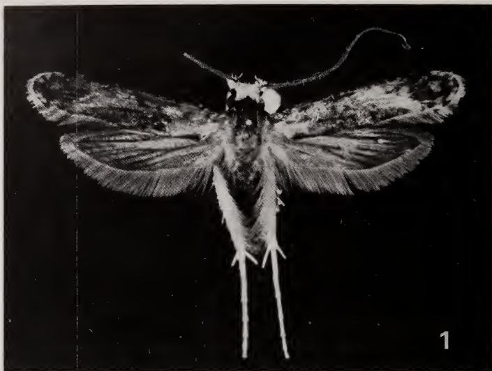
Fig. 1. Gerontha akahatii sp. n., ♂, paratype ( \times 4.5 ).

specimens are in more or less rubbed condition); off-white, nearly wholly suffused with pale brown to dark brown except for a broad, very oblique band-like area from beneath costa beyond middle to tornus; costa spotted with blackish-brown throughout; six conspicuous large tufts of pale brown raised scales, viz., three on upper margin of cell before base and at quarter and before middle of wing-length, one beneath fold before one quarter of wing-length, one in cell at a little before middle of wing-length, and one above dorsum at middle of wing-length; cilia (imperfect) very pale whitish-grey, with an interrupted blackish-brown subbasal line, and on dorsum greyish except at base. Hindwing with M1 and M2 separated, M3 from angle, Cula from five-sixths, and Culb from a little beyond middle; not transparent; scaled except for a small hyaline space at base between upper margin of cell and 1A + 2A; pale grey, with a purplish gloss in some lights; cell whitish; costal area (from base to end of Sc + R1 and as far as upper margin of cell) densely scaled, creamy; dorsal area between 1A + 2A and dorsal margin suffused with brownish scales; veins thickly streaked with rather dark brown; cilia grey, tinged with ochre.