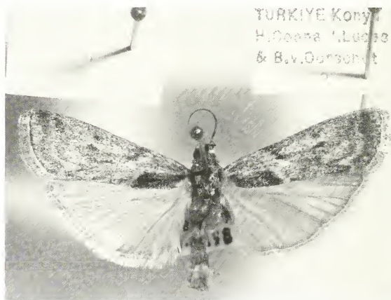
Fig. 1. Sefidia clasperella sp.n. (holotype).

PARATYPES : ♂ : Same data as holotype, except taken 31-7- 1981. G.P. 2117 Ass. In coll. ITZ Amsterdam ; ♀ : Türkiye, prov. Mersin, 10 km SE of Arslanköy, 1300 m, 11.vii.1987, leg. M. Fibiger. In coll. Asselbergs.