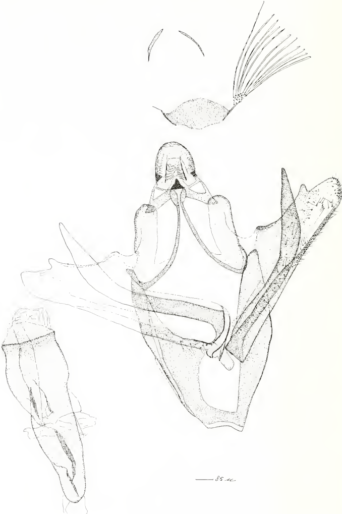
Fig. 2. ♂ genitalia of Sefidia clasperella sp.n. (holotype, G.P. 2132 Ass).