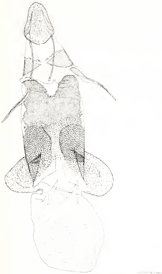
Fig. 5. ♀ genitalia of Sefidia clasperella sp.n. (paratype, G.P. 2857 Ass).