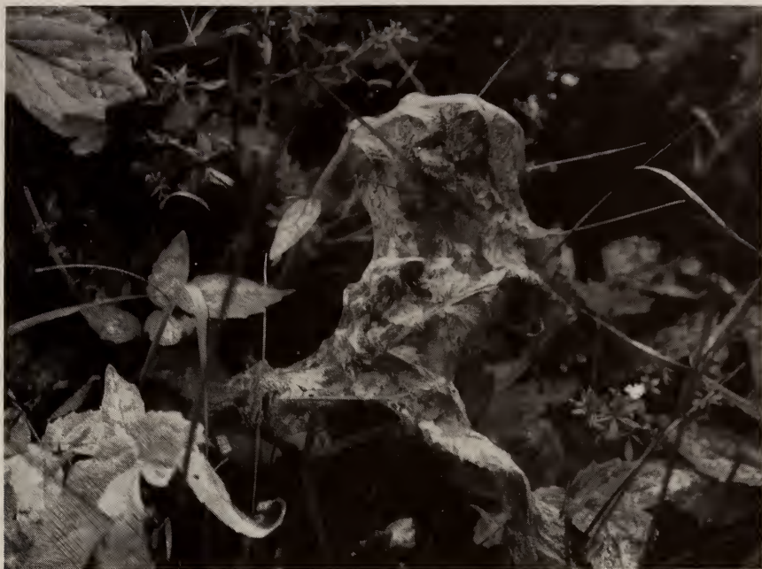
Fig. 4. A Valeriana sambucifolia plant that has been fed on by a group of 2nd instar M. diamina larvae. The silk spun by the larvae is fairly inconspicuous, but the upper epidermis left uneaten by the larvae becomes conspicuous when it dries.