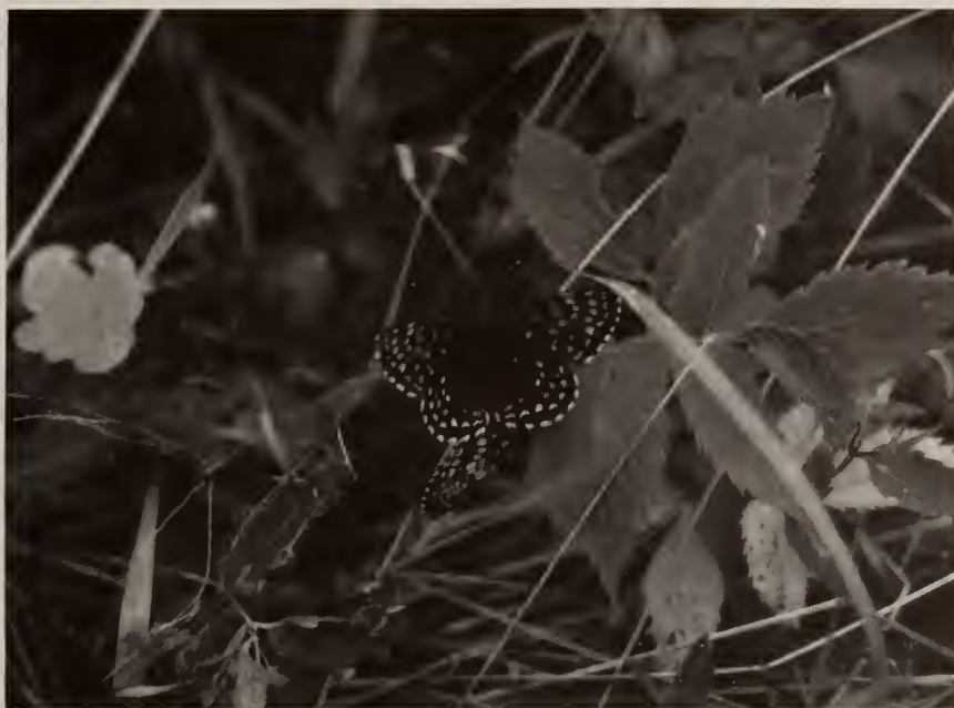
Fig. 1. A mating pair of Melitaea diamina .