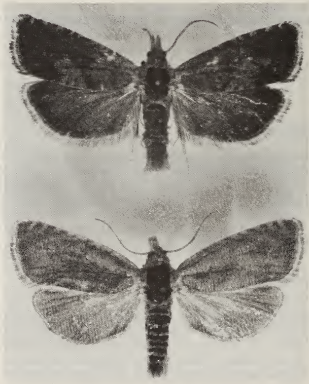
Fig. 1. From above :

The valley of the River Daugava is rich in fauna and flora with many species of eastern European origin. During one of the excursions to the valley near Daugavpils city, the first author discovered a Dichrorampha species unknown to him. When checking its genitalia according to Kuznetsov (1978), the species corresponded to D. sedatana (Busck, 1906), though otherwise externally it resembled D. plumbana (Scopoli, 1763). When comparing the unknown species with some genuine D. sedatana specimens from Denmark and Sweden some remarkable external and genitalic differences were found. The taxon is described here as a new species.