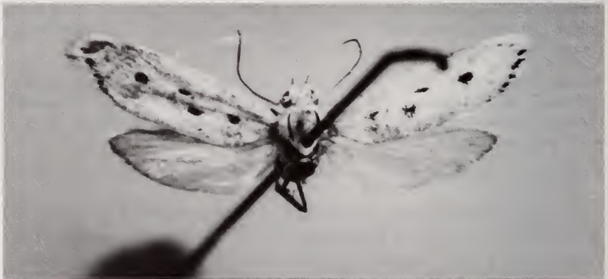
Fig. 1. Ethmia turkmeniella sp. n., holotype ♂.

DESCRIPTION. Male. Head, thorax, tegulae and antennae set with whitish scales; head bearing well developed frontal crests with a sharp outer edge. Palpae white, long, their first unit with a dense brush of scales. Legs whitish grey. Forewing length holotype 6.75 mm, paratypes 6.5–7.0 mm, wing expanse 14–15 mm. Forewings whitish grey, to some extent darker than hindwings; four contrasting grey spots arranged into two lengthwise rows and 6–7 black dots along the outer margin (fig. 1); fringes of the same colour as the wing ground-colour. Hindwing evenly white, slightly transparent, without spots.