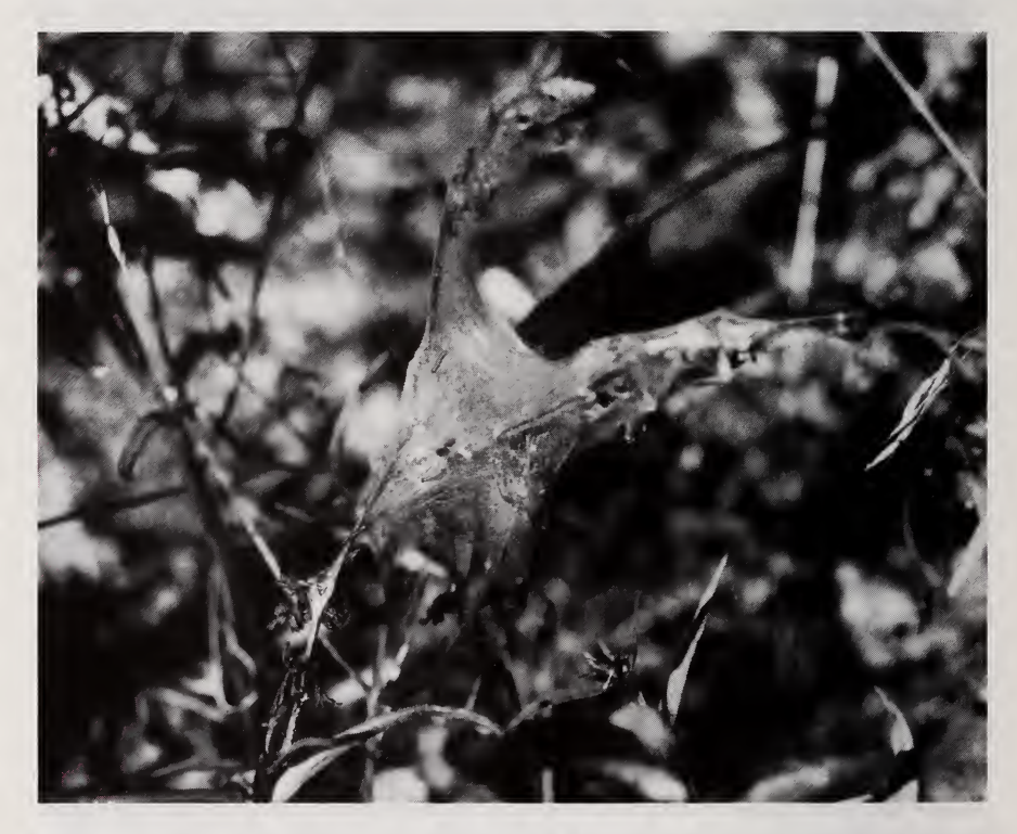
Fig. 2. A group of E. maturna 2nd instar larvae feeding on a Melampyrum pratense plant. The silken web spun by the larvae is conspicuous in autumn.

Newly emerged larvae feed partially on their egg shells and then begin feeding on the underside of the host plant leaves. The larvae spin a conspicuous silken web, within which they feed. The larvae consume the entire leaf leaving only the thickest veins intact. 2nd instar larvae enlarge the web to enclose most of the host plant (fig. 2).