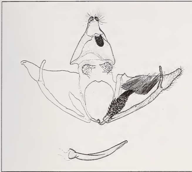
Fig. 2. Depressaria incognitella , male genitalia (slide 1019, Huisman)