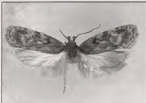
Fig. 1. Depressaria incognitella , imago. Female. (Abruzzi)

The preceding conclusion makes it necessary to redescribe the female genitalia. As the original description of D. incognitella is based on two different taxa we also give a short redescription of the imago and of the male genitalia.