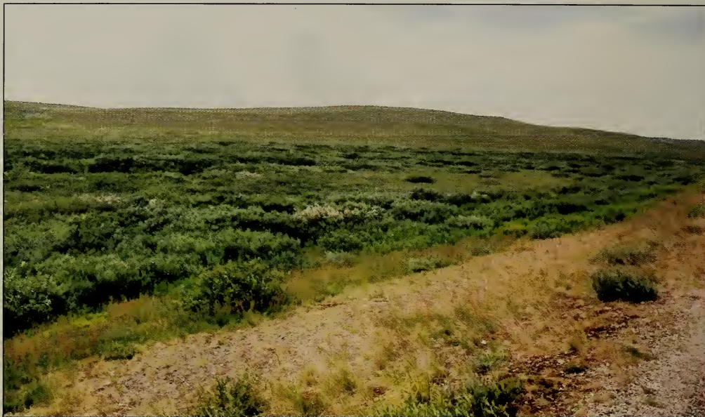
Fig. 5. Type locality of Elachista tanaella sp. n., North Norway, Tana: Faccabæljåkka.

present in ductus bursae near insertion point of ductus seminalis; corpus bursae longer than wide; signum an elongate dentate plate, widest in middle. There is great variation in the length of the apophyses anteriores. In three dissected females the ratios of the length of the apophyses posteriores and the length of the apophyses anteriores are 0.9, 1.6 and 1.9. The ratio for each specimen is the mean value of the ratio of the left and the ratio of the right pair of apophyses. Figs. 3a and 4a show the extremes.