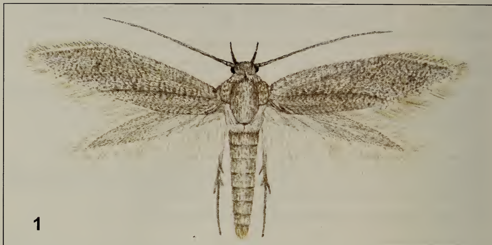
Fig. 1. Elachista tanaella sp. n., adult male (wingspan 11 mm).