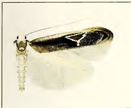
Fig. 3. Blastodacna libanotica Diakonoff, 1939, ♀ (watercolour J. C. Koster).