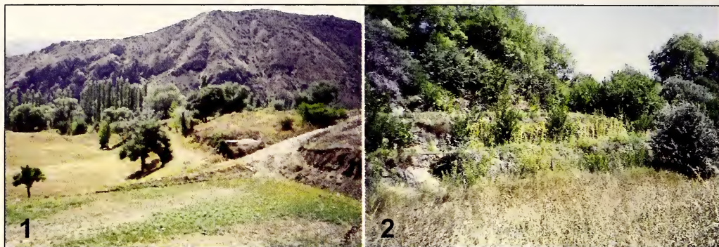
Figs. 1–2. Habitat of Blastodacna libanotica. 1. Turkey: Province of Erzurum near Oltu. 2. Habitat in detail showing wild pear trees.