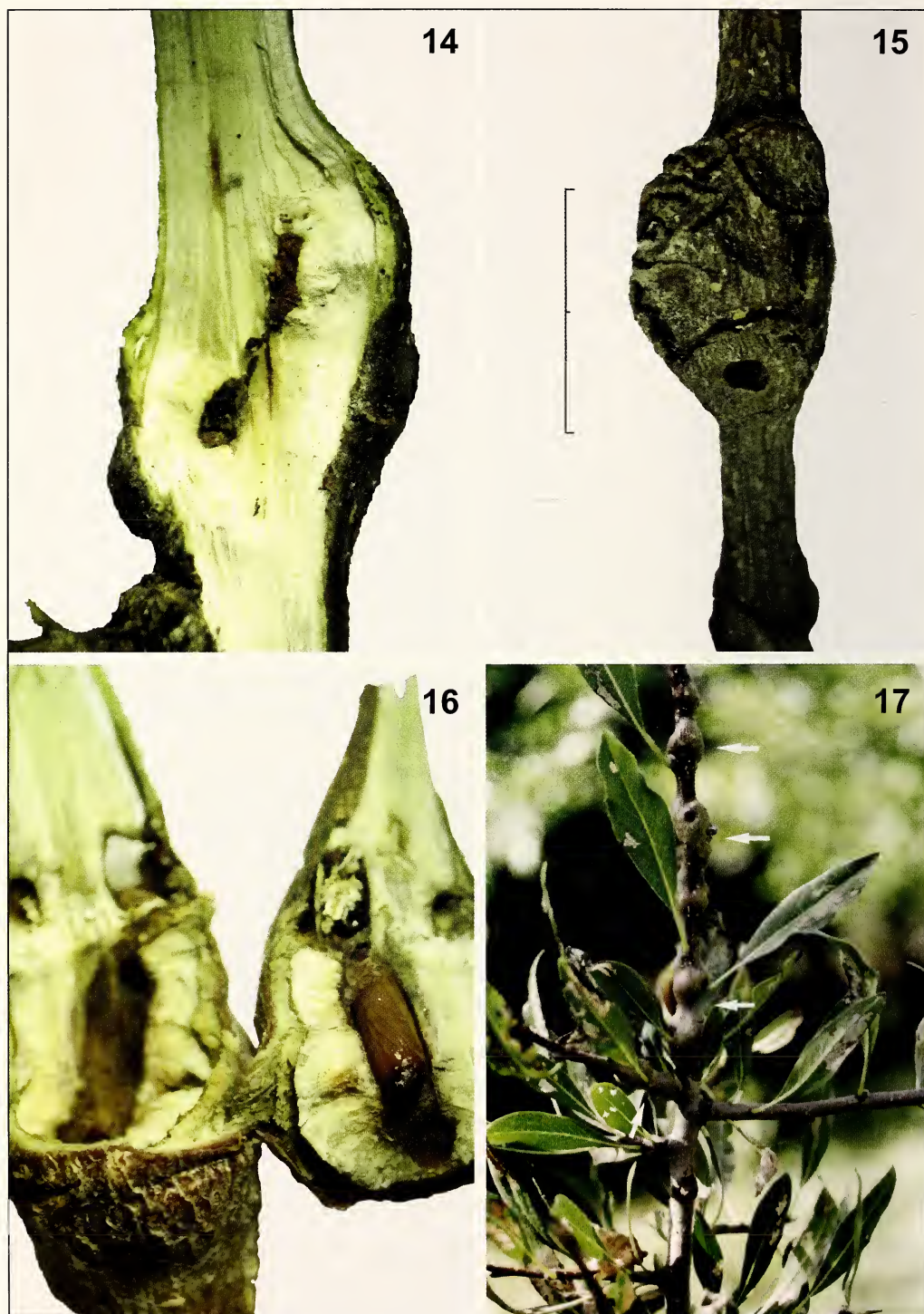
Fig. 14–17. Features of the galls of Blastodacna libanotica Diakonoff (photos H. Özbek). 14. Longitudinal section of the gall with the upward part of the gallery. 15. Gall with exit-hole (scale bar 10 mm). 16. Longitudinal section of the gall with the pupa, its head directed toward the exit-hole. 17. Twigs with united galls.