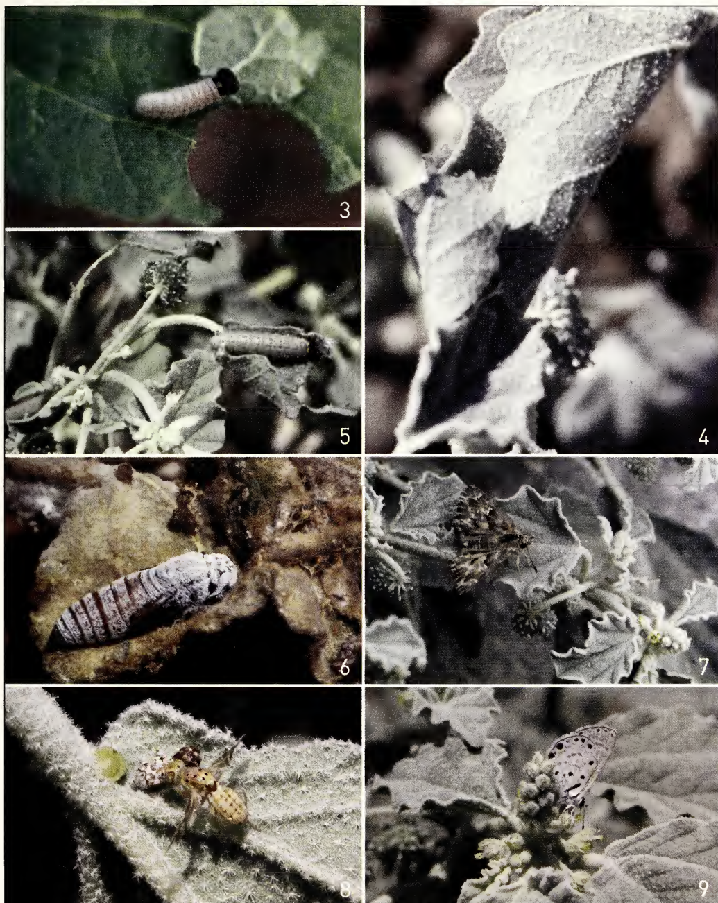
Fig. 3–9. 3. A young larva shown preparing its shelter on an Alcea setosa leaf. Santa Katarina Monastery, South Sinai, 1600 m, 22.vii.1979. 4. Carcharodus alceae larval leaf pod on Chrozophora tinctoria . Same location and date as Fig. 1. 5. Fully grown larva on Chrozophora tinctoria . Sasa, Upper Galilee, 880 m, 24.vii.2004. 6. Winter diapausing Carcharodus alceae pupa. Kibutz Haogen, Hasharon district, Central Coastal Plain, Israel, 4.x.2003. 7. Fresh Carcharodus alceae female from a larva which had developed on Chrozophora tinctoria . Sasa, Upper Galilee, 880 m, Israel, 4.viii.2004. 8. Extrafloral nectaries of Chrozophora tinctoria . Attending beetles Anthrenus sp. (Dermestidae) and a fruit fly Chaetorellia sp. (Tephritidae) are possibly attracted to the nectaries. Rantis, Central Israel, ca. 200 m, 3.vii.2004. 9. Azanus jesus nectaring on a flower of Chrozophora tinctoria . Hexagon Pool, Golan Heights, 50 m, 31.vii.2004.