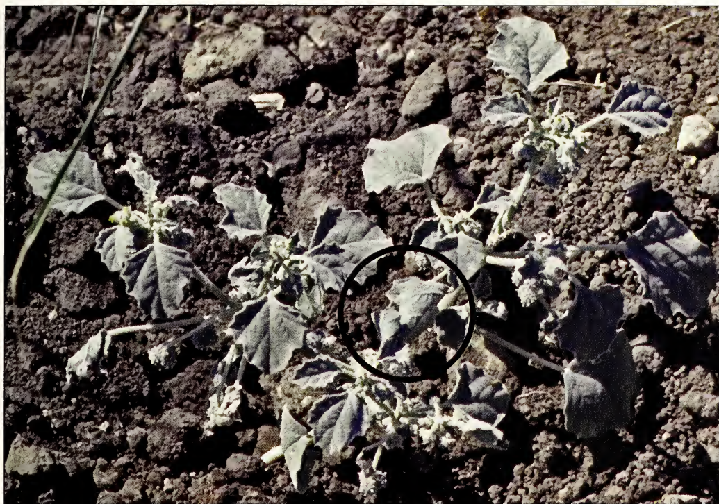
Fig. 1. Chrozophora tinctoria , the new host-plant of Carcharodus alceae at Kibutz Haogen, Hasharon district, Central Coastal Plain, Israel, 19.ix.2003 (circled: a leaf pod of C. alceae larva).

were laid only on the wild plants, at the base of the dry flower stalks where few green leaves still existed. The females totally ignored the other A. setosa plants which carried fresh and larger leaves. Only when the few leaves of the wild plants were consumed did the females start to lay on the hybrids. The cultivated A. setosa were not visited by any female and remained unused. It is quite astonishing that the C. alceae females could sense exactly, and with no mistake, which plant they preferred. Does it mean that these three types of plants are chemically different?