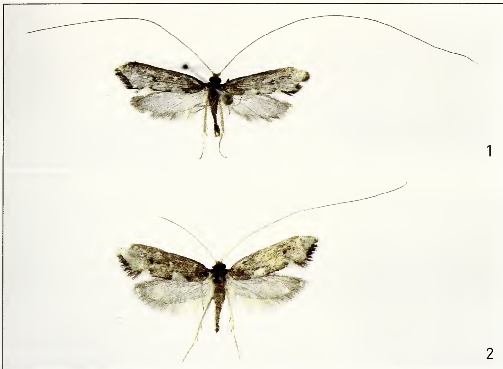
Figs 1, 2. Nematopogon stenochlora . 1. female, Spain, prov. Malaga, Marbella, El Mirador, 3.ii.1984; 2. male, Spain, prov. Malaga, Casares, 9.ii.2003.

and Spain); discal spot absent in light specimens (e.g. in syntypes) but present in dark specimens (e.g. those collected in Spain). Cilia from pale ochreous, indistinguishable from forewing colour (e.g. in syntypes) to dark brown, clearly contrasting to forewing background (e.g. in specimens collected in Spain). Light marks on dorsal margin of forewing greatly variable. The tornal mark is always present, although minor (a few scales) and almost indistinguishable in light specimens (e.g. in syntypes); however, even in these extreme situations the light colour of cilia marks its occurrence (this can be seen even in the paralectotype, see Nielsen 1985: 17, fig. 25). The proximal mark (located at approx. 1/3 of forewing length) is absent in most specimens from Algeria, although traces of it are present in two specimens from Constantine; in contrast, this mark is very distinct (reaching 0.15 \times forewing length and 0.20 \times forewing width) in specimens from Spain. Hindwing sparsely scaled, semi-translucent, from pale greyish to light brown. Legs light brown. Epiphysis at 0.3 , not reaching apex of tibia. Abdomen greyish brown.