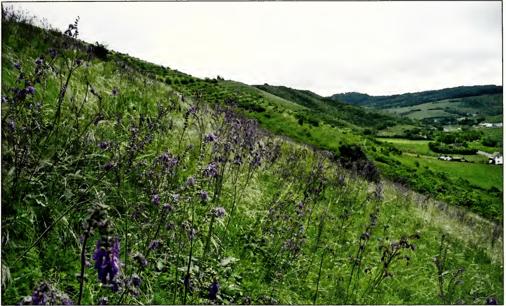
Fig. 1. Terraces with flowering Salvia nutans at Suatu – suitable habitat for P. bavius hungarica .

which are shorter and more visible in later larval developmental stages (Fig. 7). Both field and laboratory observations showed that the last instar larvae have a lower mobility, but they still move from one floret to another without leaving the host plant.