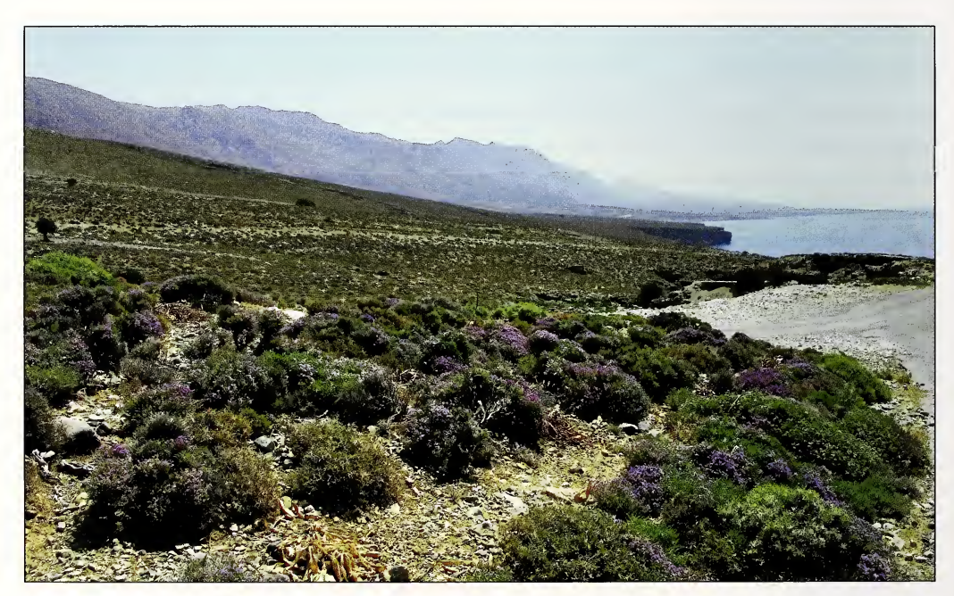
Fig. 3. South coast of Crete near Hora Sfakion from where the specimen of Symmoca sparsella was obtained.