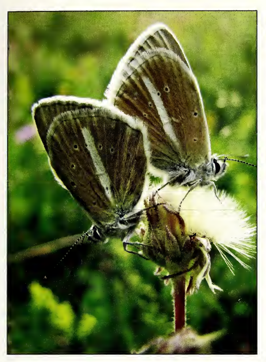
Fig. 3. Polyommatus damon resting on grass, Mt. Troglav.

a high number of recorded specimens. For example, on Mt. Troglav, in a small surface area of 2 \times 2 m<sup>2</sup>, more than 20 individuals were counted resting at sunset.