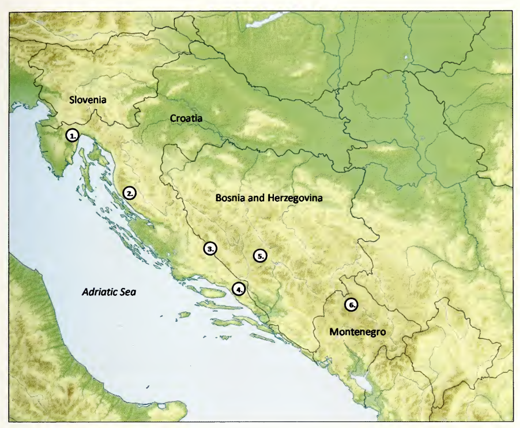
Fig. 2. The best surveyed mountains in the Dinaric region: 1. Mt. Učka, 2. Mt. Velebit, 3. Mt. Dinara, 4. Mt. Biokovo, 5. Blidinje, 6. Durmitor.