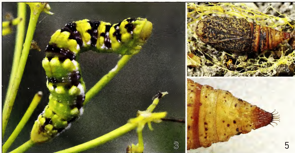
Fig. 3–5. Holoterpna pruinosa (Staudinger, 1897), Crimea, 2 km NW of Staryy Krym, Agarmysh Mt., 600 m, 31.vii.2009. 3. Final-instar larva; 4. Pupa; 5. Cremaster of pupa.

Emergence of moths from pupae that overwintered in captivity took place between May 18 and July 2. However, judging from the larval records in nature, we assume that the natural flight period takes place during the second half of July.