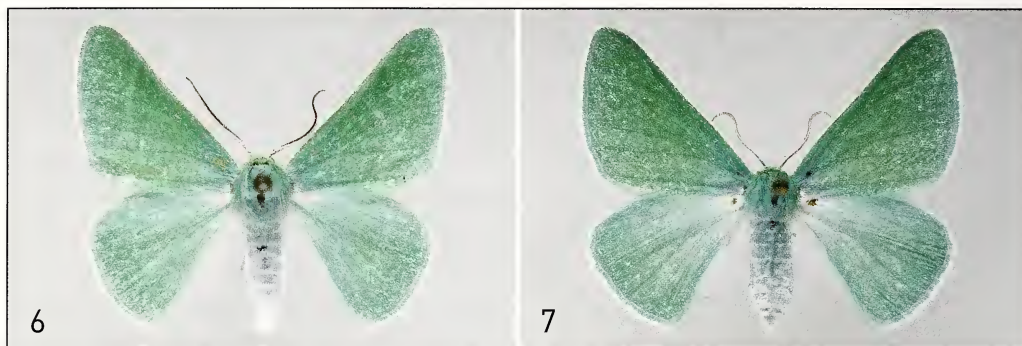
Figs 6, 7. Holoterpna pruinosa (Staudinger, 1897), Crimea, 2 km NW of Staryy Krym, Agarmysh Mt., 600 m. 6. Ex larva, ♂, 24.vi.2012. 7. Ex larva, ♀, 20.vi.2012.

Adults are aphagous, in captivity their lifespan is between two and seven days. Forewing length is 10–14 mm in males, 14–18 mm in females. Ground colour of head, pronotum, legs, abdomen and wing upper side is plain bluish-green (Figs 6, 7); in some individuals the hindwings are paler coloured than the forewings. Forewing costal margin and antennal shaft are white. Underside of both fore- and hindwings is bluish-green, gradually becoming paler towards the anal margin, which is almost white. Proboscis is reduced.