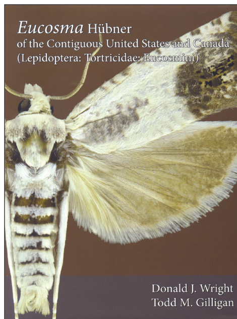
Figure 1. The cover of the book.