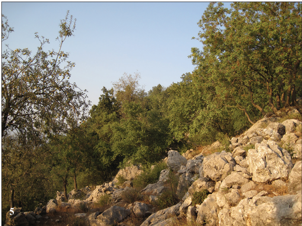
Figures 4–5. Type locality of M. jabalmoussae sp. n..