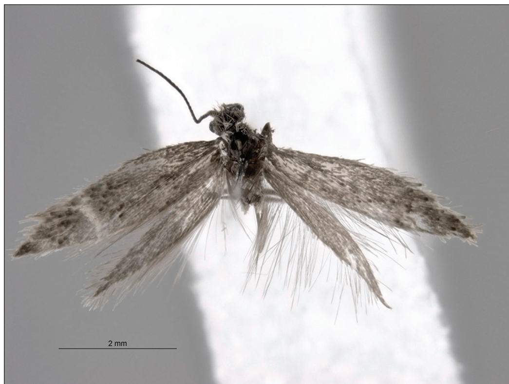
Figure 1. Catapterix tianshanica sp. n., holotype in dorsal view.

segment without filamentous sensilla. Male genitalia (Figs 4–6): Segment IX clearly longer than valvae, forming a well-sclerotized, ringlike structure, not dissociated into vinculum and tegumen, but with a separated, dark ribbon on proximal margin; on ventral side proximal margin slightly excavated. Uncus in horizontal position, deeply bilobed, with ventrad curved, acute apices and one small, triangular process on each lateral side. Gnathos absent. Transtilla nearly membranous; medial process indistinct, without teeth or serrations on ventral side. Juxta incorporated into segment IX and situated in proximal position before bases of valvae, elongate, plate-like, with sclerotized margin and rounded base. Valva with somewhat rectangular base, but without sclerotized basal apophysis; broad sacculus present, bent mediad; costal margin sinuslike, terminating in a digitate process, curved dorso-mediad. Phallus tubular, as long as the entire genitalia apparatus, connected with juxta at distal opening; interior walls with folds and indistinct sclerotizations; cornuti apparently absent. Female: unknown.