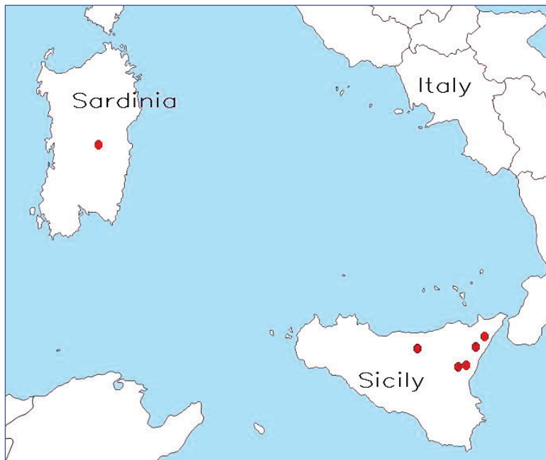
Figure 6. Map of distribution of Bucculatrix brunnella sp. n.

Etymology. The specific name brunnella is derived from the forewing colour of the new species.