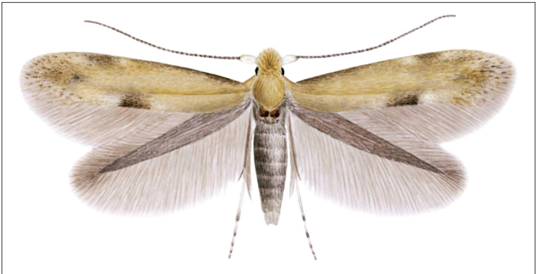
Figure 2. Bucculatrix brunnella sp. n., female, paratype, Mount Etna, Nicolosi, 20.vi.2008, wingspan 6.5 mm.

costa narrowly edged dark brown to three-fifths, and with dark brown spot at the end edged from creamy white to light ochreous, some brown apical scales, a conspicuous dark brown dorsal spot edged creamy white to light ochreous at three-quarters and a dark brown subapical spot.