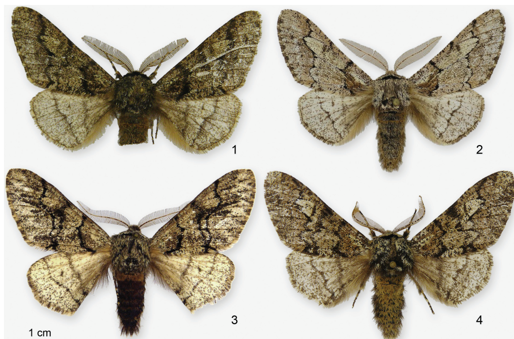
Figures 1–4. Male imagines of Biston species (wingspan 40–45 mm). 1. B. rosenbaueri sp. n., Holotype (Greece, Thrace, Avantas, coll. Rosenbauer). 2. B. rosenbaueri sp. n. Paratype (Croatia, Krk Island, coll. and photo EFJ). 3. B. achyra Wehrli, 1936 (Greece, Samos, Kokkari, coll. ZSM). 4. B. strataria (Hufnagel, 1767) (Germany, Mark Brandenburg, Dannenreich, coll. BMB).

to apex. Costa slightly concave, sacculus nearly straight. Saccus wide, rounded, medially short, often bent trapezoid projection. Aedeagus narrow, slightly bent, apically 1.35–1.55 mm striated, no cornutus. Length of aedeagus: 3.05–3.2 (on average 3.0) mm.