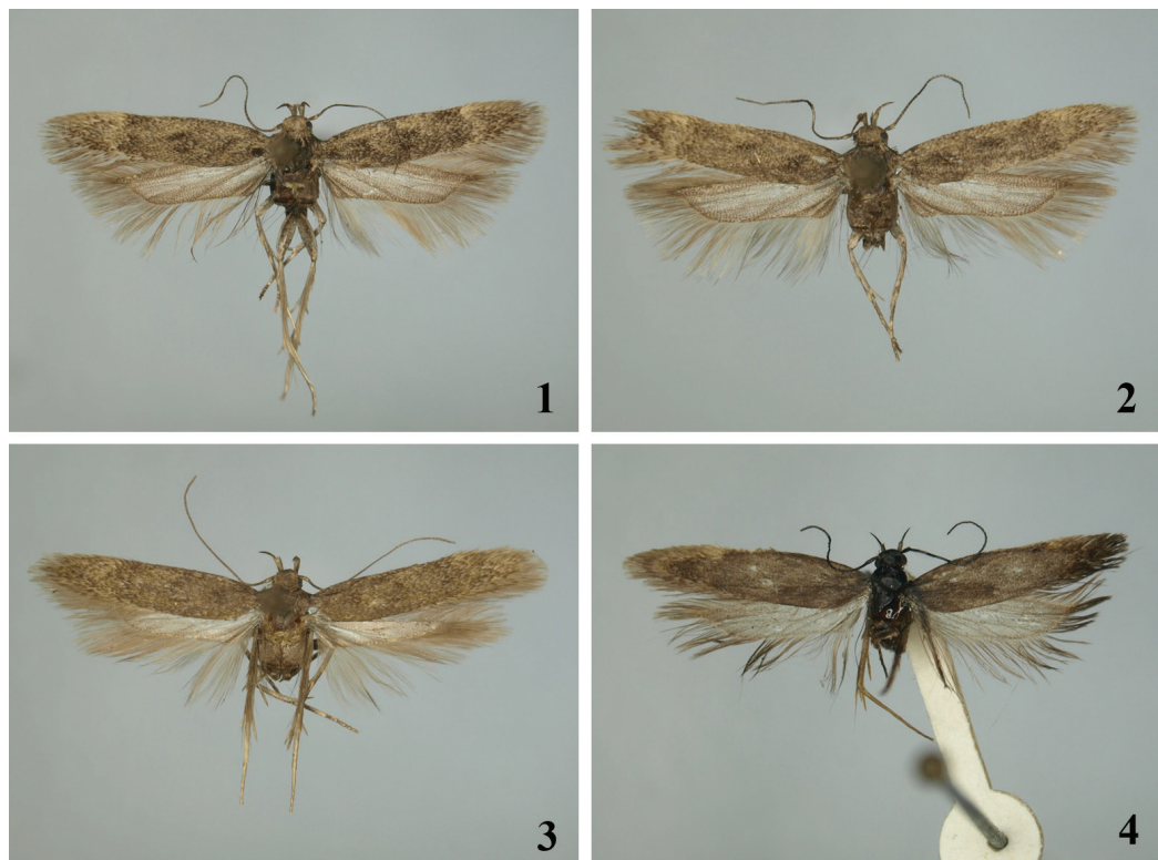
Figures 1–4. Adults of Spiniphallellus spp. 1–3. S. eberti sp. nov. 1. Holotype (genitalia slide 64/17, O. Bidzilya). 2. Paratype, ♂ (genitalia slide 55/17, O. Bidzilya). 3. Paratype, ♀ (genitalia slide 60/17, O. Bidzilya). 4. S. naumanni sp. nov., holotype (genitalia slide 46/17, O. Bidzilya).

Biology. Host plant unknown. Adults have been collected in early July at an elevation of about 2000 m.