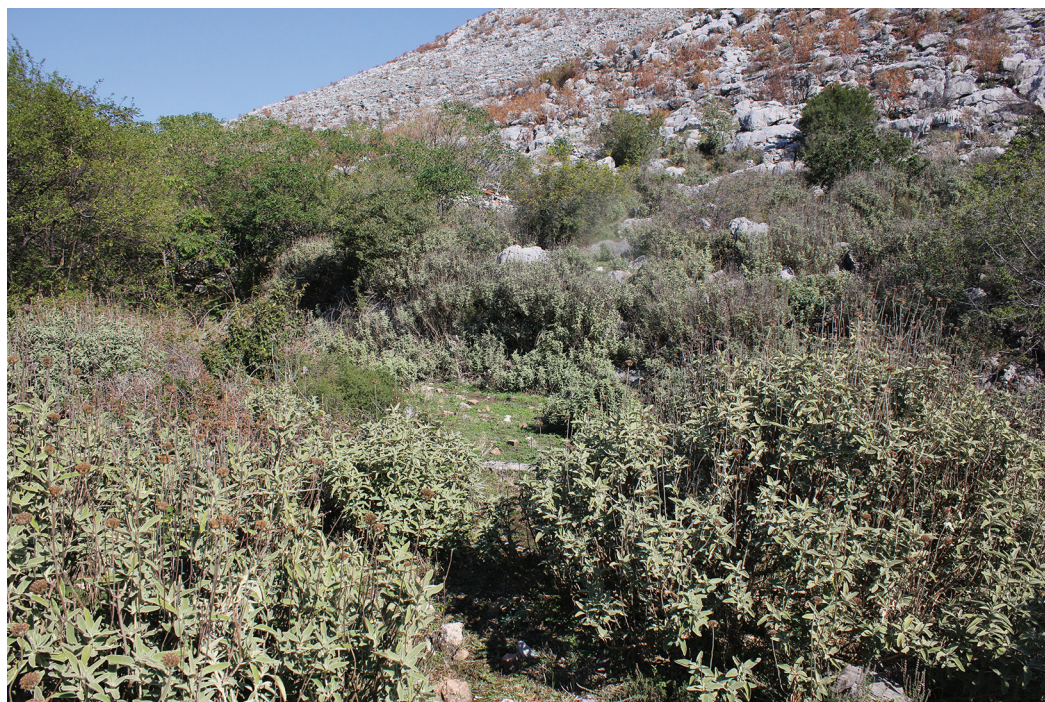
Figure 2. Habitat of Muschampia proto in Uskoplje, Bosnia & Herzegovina.