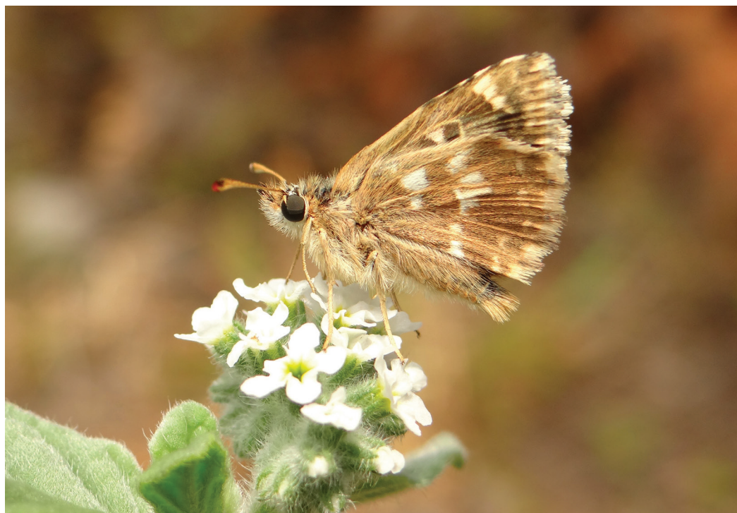
Figure 3. Muschampia proto from Šumet near Golubov kamen.