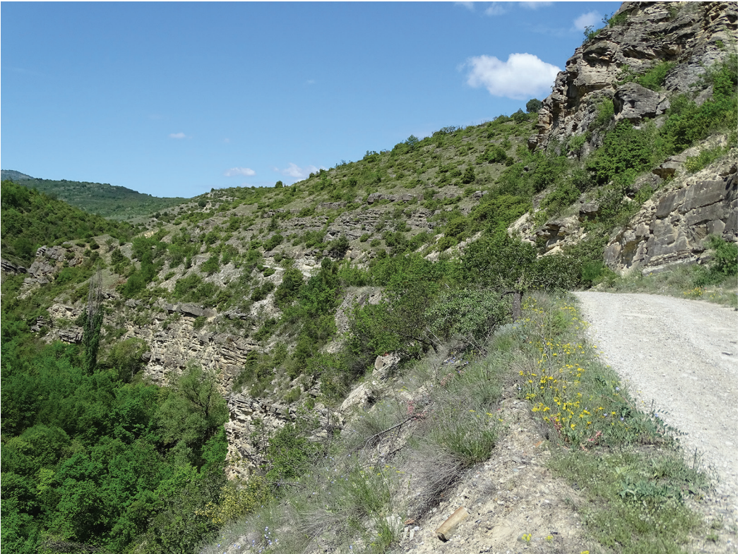
Figure 2. Habitat of Elegia occultalis Plant, sp. nov. North Macedonia: Vardar River Valley, above Demir Kapija, 244 m. Pseudomaquis with Juniperus excelsa M. Bieb., Juniperus oxycedrus (L.) (Cupressaceae), Paliurus spina-christi Mill. (Rhamnaceae), Pistacia terebinthus L. (Anacardiaceae), Phillyrea latifolia L., Fraxinus ornus L. (Oleaceae), Quercus pubescens Willd. (Fagaceae), Astragalus sp. (Leguminosae), Astracantha spp. (Fabaceae), Silene sp. (Caryophyllaceae), etc.

orbicular, reniform and claviform stigmata obscure. No basal spot. Wing grey-scaled in basal area (basal 2.5 mm), with some scales minutely irrorate whitish, beyond which is a black band, equating to the ante-median fascia, extending from costa to dorsum, approximately 1 mm wide at the costa and 1.5 mm wide at dorsum. Outer edge of this black band more or less straight and more or less meeting costa at 90 degrees; inner edge less sharply defined, bulging basad at mid-point where a small, almost indiscernible area of grey scales with white apices affects the central 50% of the wing, centred on the median fold. Distal edge of the black band is defined by a 0.5 mm wide band of whitish grey scales, poorly-defined on the distal edge, but macroscopically perceived as a narrow, dirty white band beyond the black band. Remaining (distal) area of forewing upper side grey-scaled with markings largely obfuscated, except for dentate subterminal line picked out by darker, blackish scales. Terminal line defined by 4 or 5 small dark spots. Cilia long, alternating grey and darker grey. Hind wing upper-side uniformly grey except for slightly darkened terminal line, most obvious in the apical region. Cilia uniformly