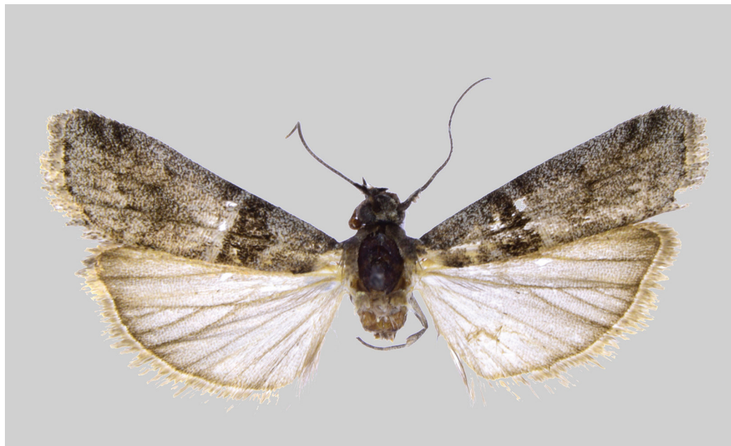
Figure 3. Elegia occultalis Plant, sp. nov. Holotype male, Albania, 15.v.2017.