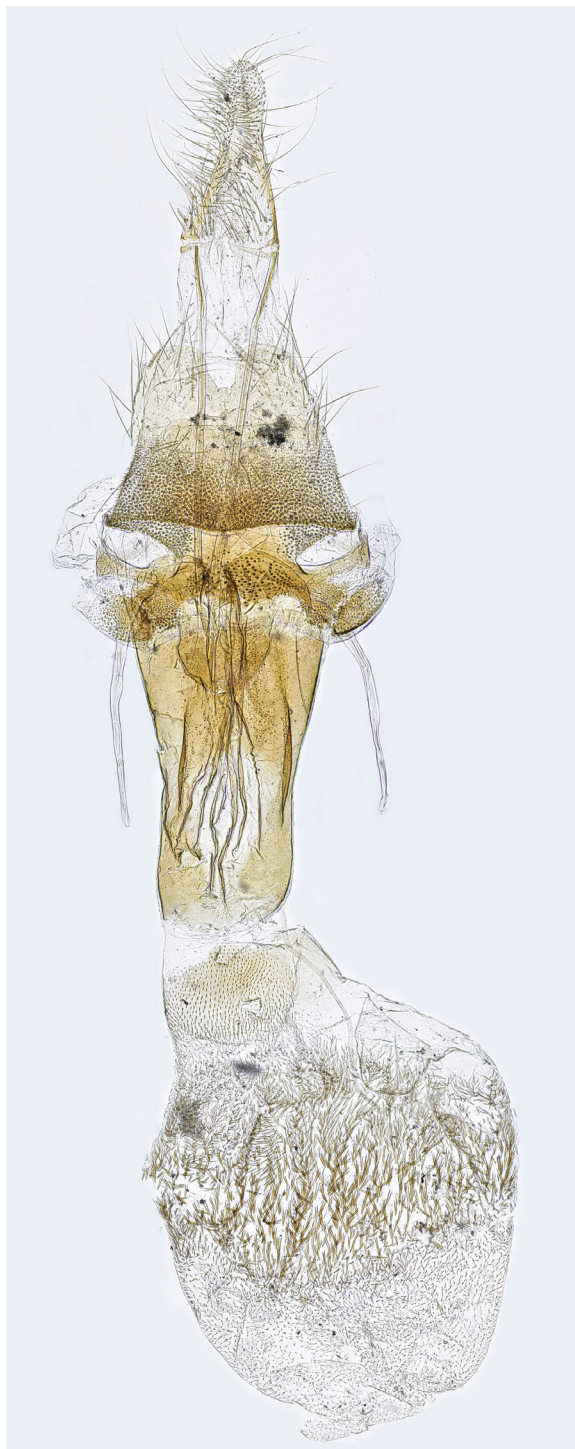
Figure 6. Elegia occultalis Plant, sp. nov. genitalia of paratype female. In euparal on glass slide, CP/1998/20, by CWP.