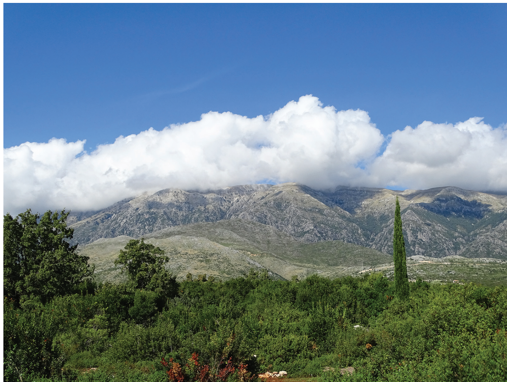
Figure 1. Habitat of Elegia occultalis Plant, sp. nov. Albania, coast below Ilias, near the St. Theodor monastery, 140 m. Maquis with Olea europaea L. (Oleaceae), Quercus macrolepis Kotschy, Q. coccifera L., Q. ilex L. (Fagaceae), Arbutus unedo L., Calluna vulgaris (L.) Hull (Ericaceae), Pistacia lentiscus L., P. terebinthus L. (Anacardiaceae), Cupressus sp., (Cupressaceae), Ficus carica L. (Moraceae), Cistus sp. (Cistaceae), etc.

as a result of further research, that the range of the new species overlaps geographically with that of E. iozona , then confusion between these two taxa is also likely to require genitalia examination for resolution. Separation from two recently described Turkish species is achievable by comparison of the shape of the gnathos, which is round in E. occultalis , spoon-shaped in feminina and ovoid, with an angular apex in saecula .