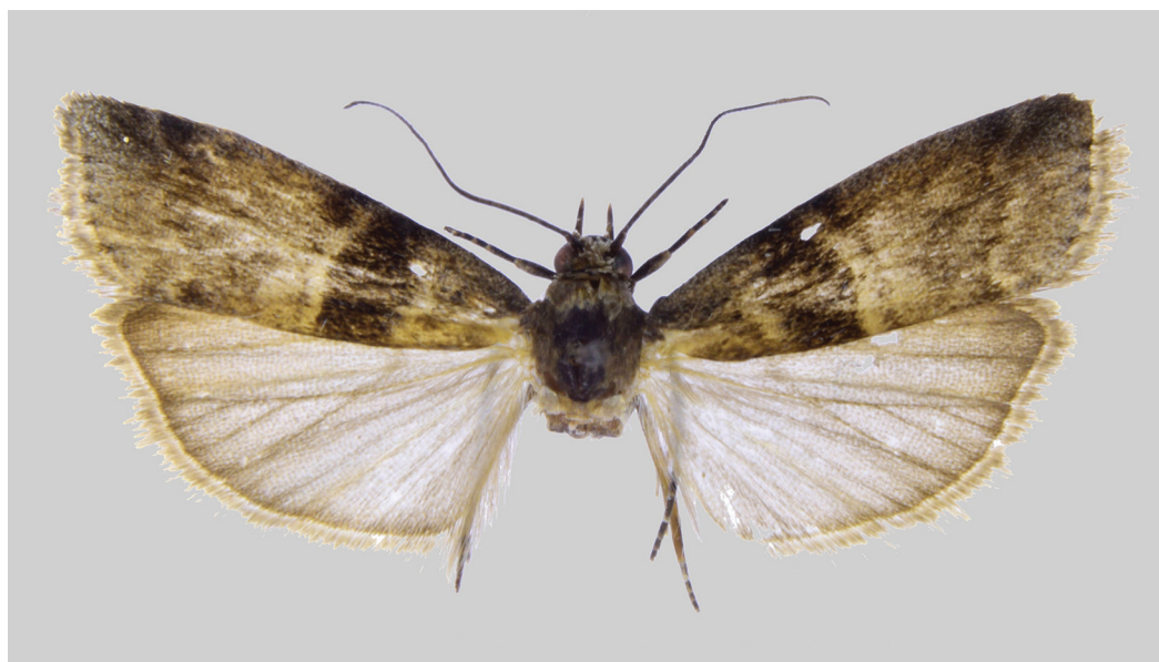
Figure 4. Elegia occultalis Plant, sp. nov. Paratype female, North Macedonia, 13.vii.2019. The slight yellowing of the forewings is a consequence of the specimen becoming “greasy”; in life, the wing colour is identical to that of the male.