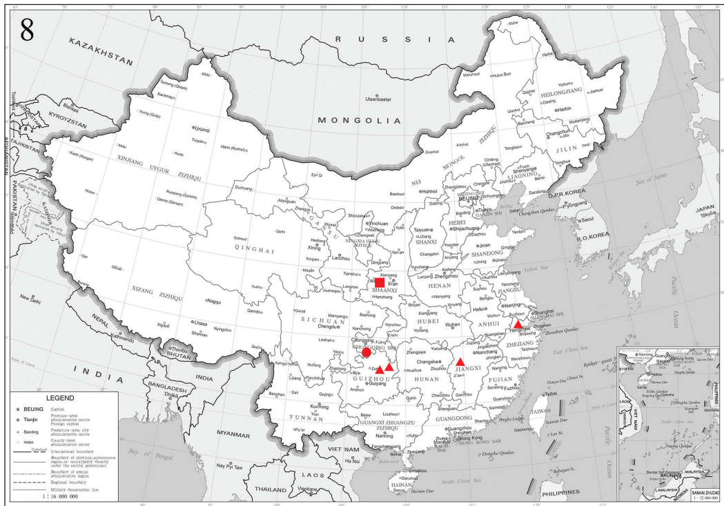
Figure 8. Distribution map of Chinese Striogyia spp., circle: S. simianshana sp. nov. (Chongqing Municipality); triangles: S. obatera Wu, 2011 (Prov. Guizhou, Jiangxi, Zhejiang and Hubei); square: S. acuta Wu, 2020 (Prov. Shaanxi).

The main vegetation found around the site where the specimen was collected include Fagus longipetiolata Seemen (Fagaceae), Castanopsis fargesii Franch. (Fagaceae), Engelhardia roxburghiana Wall. (Juglandaceae), Fokienia hodginsii (Dunn) A. Henry & H. H. Thomas (Cupressaceae), different kinds of bamboo, and a large number of shrubs and ferns growing in the ground cover layer of the forest. However, the larval host of this species is yet to be determined as no specimens have been collected in its immature stage.