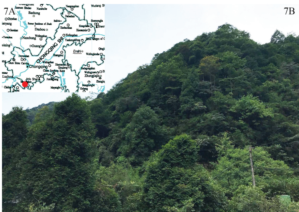
Figure 7. Map and habitat of S. simianshana sp. nov.. A. Collecting site: Chongqing Municipality, Mt. Simian (red dot); B. Collecting site close to a subtropical mixed forest.

Abdomen. Dorsally yellowish-brown to dark brown, with mixed yellow and black; 8th sternite (Fig. 2c) slightly sclerotised, concave in distal margin, bearing dense spines.