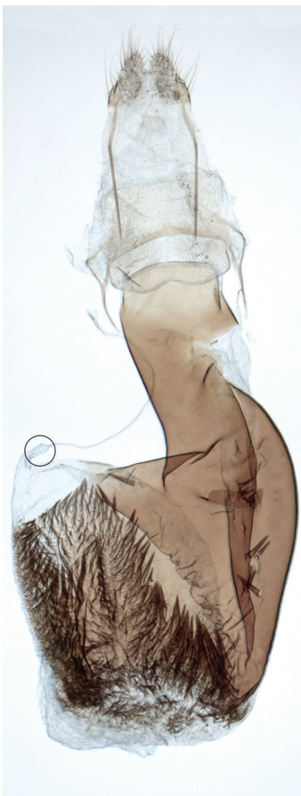
9. E. phoeniceata slide GP6226