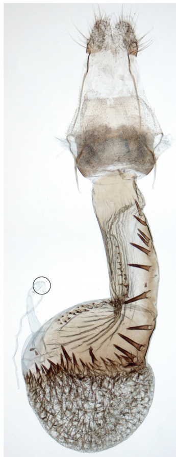
10. E. oxycedrata slide GP6237

Figures 8–10. Female genitalia of Eupithecia spp. 8. E. conquesta sp. nov., paratype, GP 6236 J. Tabell. 9. E. phoeniceata (Rambur), France, La Ciotat, 24.x.1963, GP 6226 J. Tabell. 10. E. oxycedrata (Rambur), Spain, Mijas, 24.ix.2012, GP 6237 J. Tabell. Circle indicates the point of origin of the ductus seminalis.