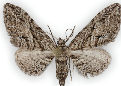
4. E. oxycedrata ♀