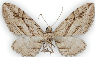
3. E. phoeniceata ♀

CYPRUS Paphos 1,5 Km N of Peyia 10. XI. 2021. Leg.: Attila Szabó & Zsuzsi V.B. 350m