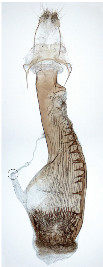
8. E. conquesta sp. nov. paratype, slide GP6236