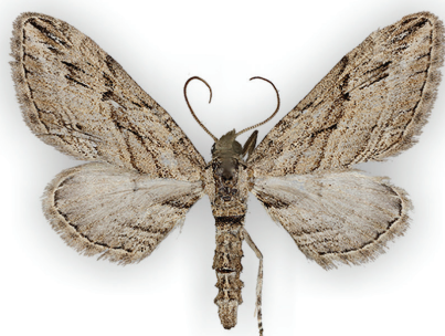
1. E. conquesta sp. nov. ♂ paratype