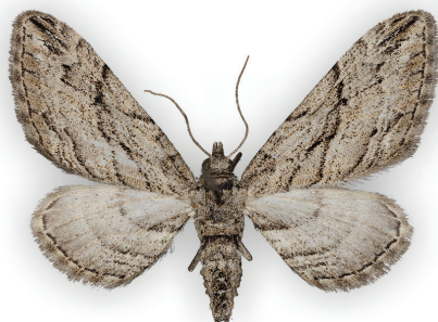
2. E. conquesta sp. nov. ♀ paratype

CYPRUS Paphos 1,5 Km N of Peyia 05. XI. 2021. Leg.: Attila Szabó & Zsuzsi V.B. 350m